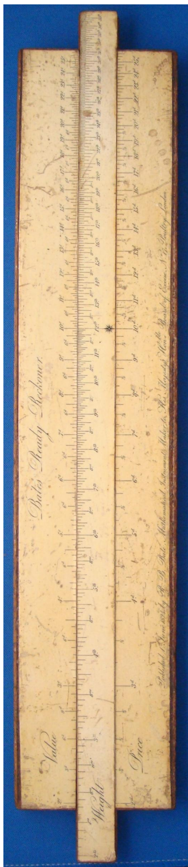
Figure 1: TCD-SCSS-U.20121208.037-fig01