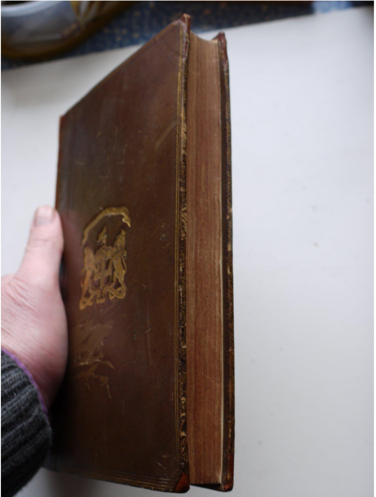
Figure 6: William Whewell's History Of The Inductive Sciences, page-edges