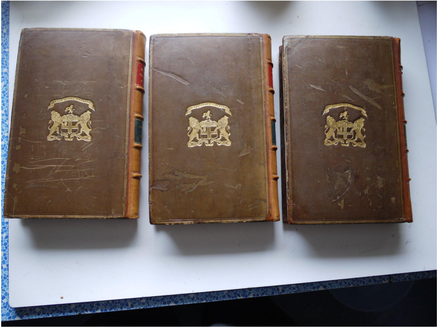
Figure 3: William Whewell's History Of The Inductive Sciences, rear covers.