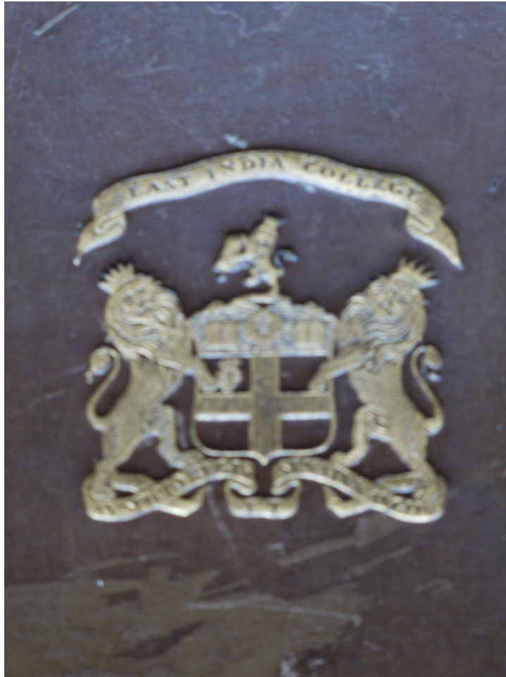
Figure 5: William Whewell's History Of The Inductive Sciences, East India College Crest.