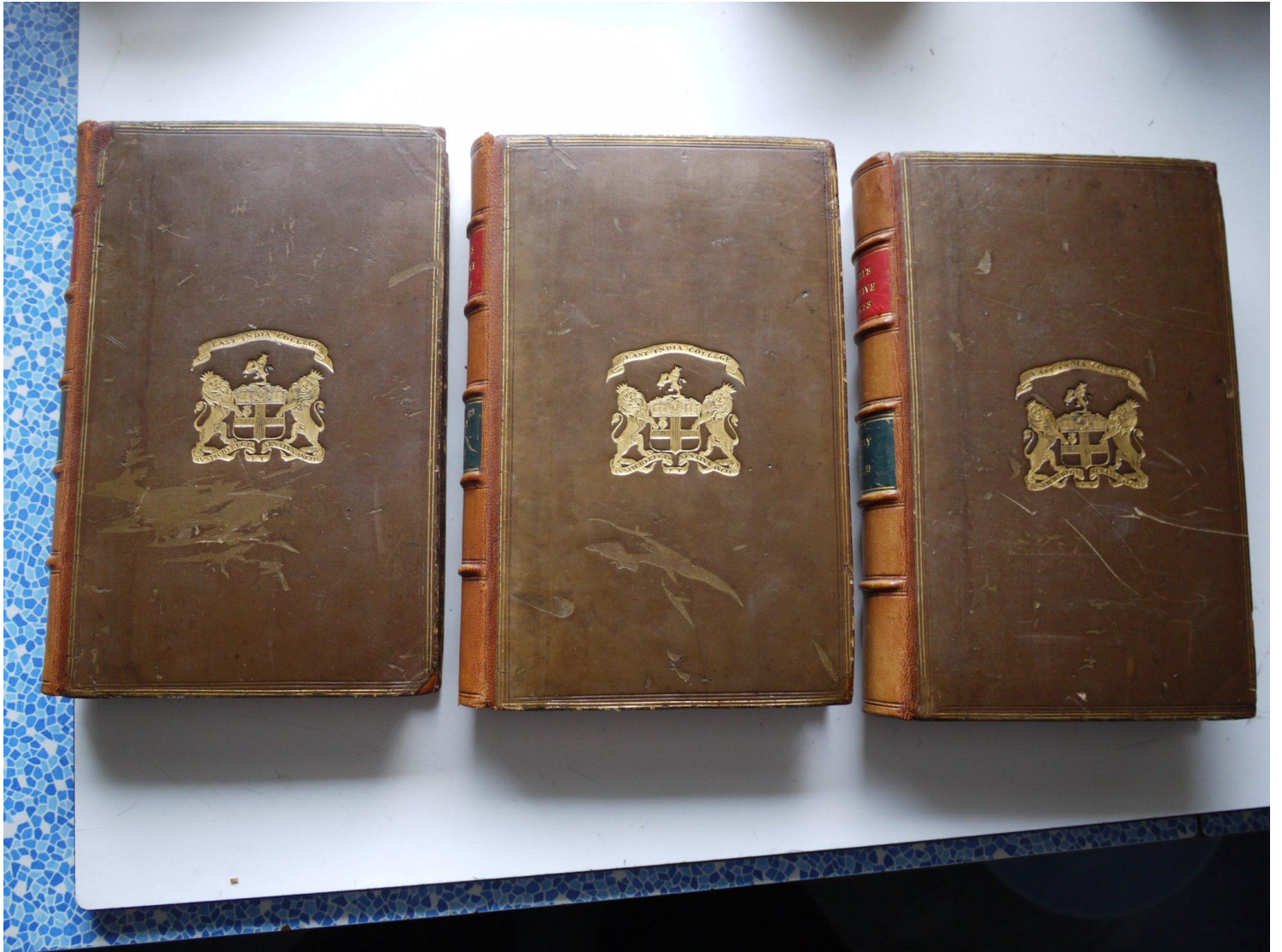
Figure 2: William Whewell's History Of The Inductive Sciences, front covers.