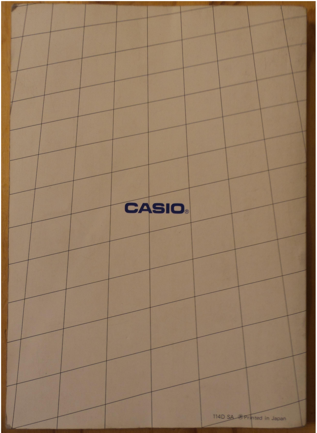
Figure 2: Casio PB-110 Owner's Manual rear cover