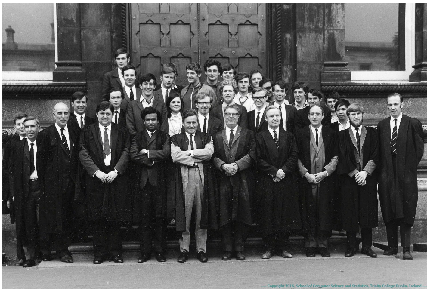
Figure 1: Class Photograph, TCD Engineering School BAI Class of 1966-1970 (includes first undergraduate TCD Computer Science class)