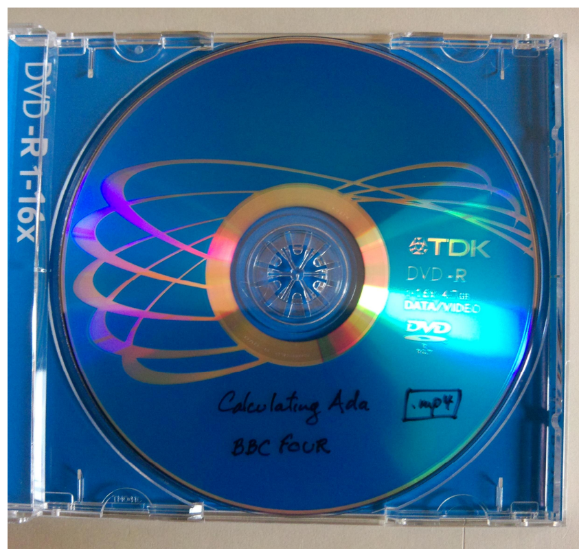
Figure 2: Calculating Ada, front view of DVD