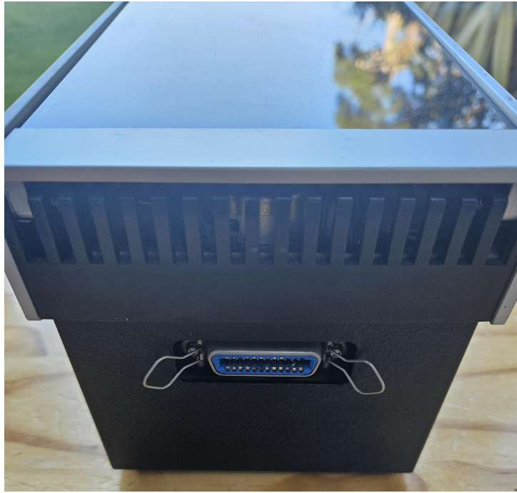
Figure 3: TEAC Datapack MT-6 rear view.