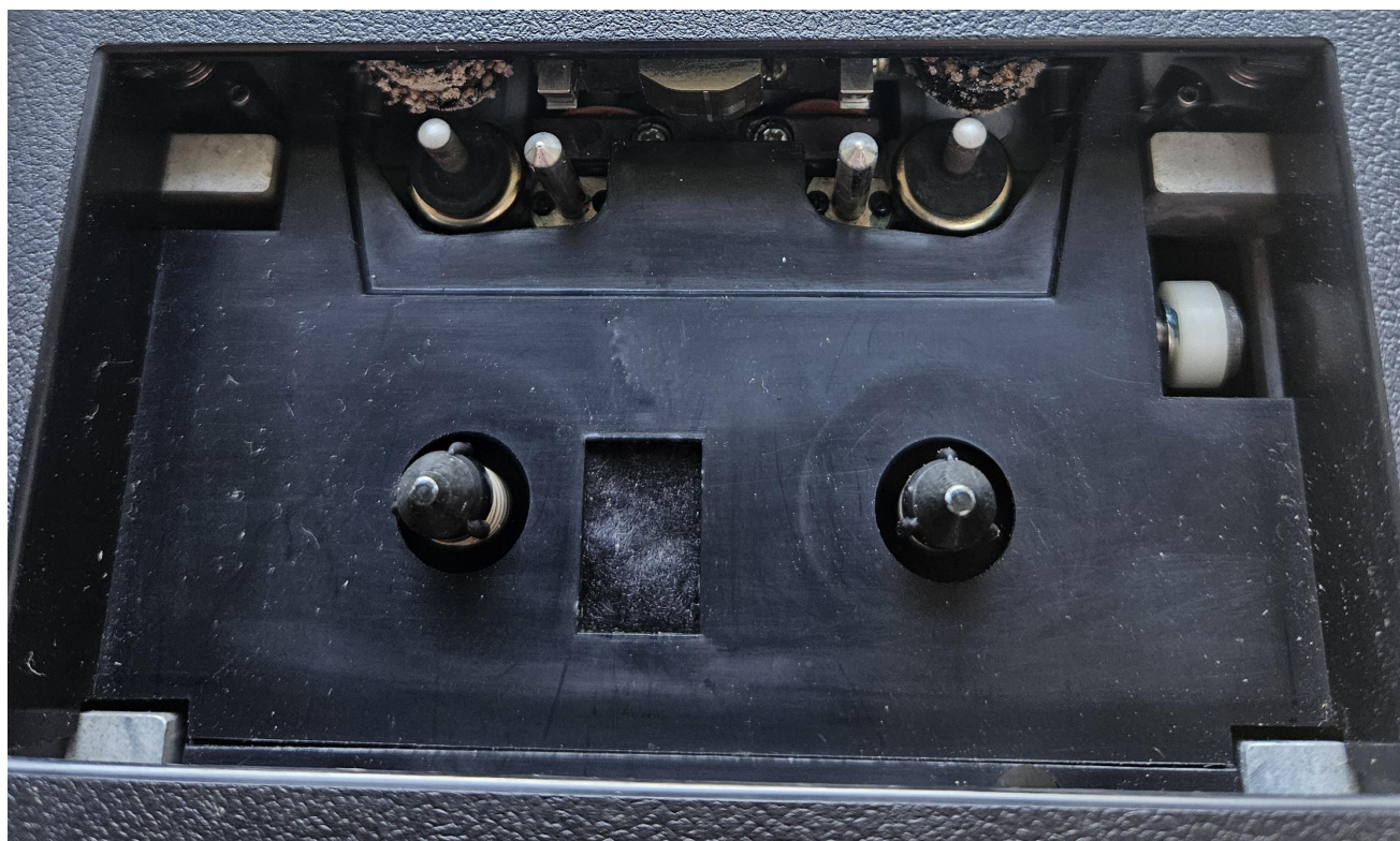
Figure 2: TEAC Datapack MT-6 view of tape heads. Note the perished tape rollers.