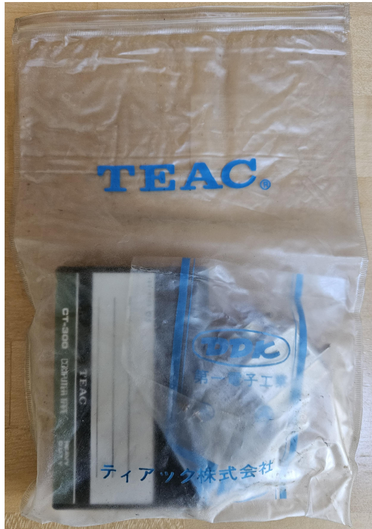
Figure 6: TEAC Datapack MT-6 rear connector view.