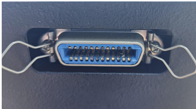
Figure 4: TEAC Datapack MT-6 rear 24-pin D-type connector view.