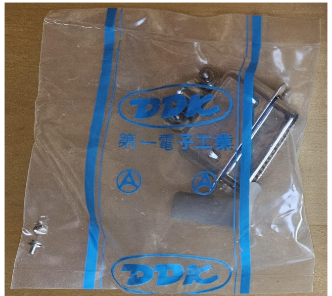
Figure 7: Left: TEAC Datapack CT-300 data cassette tape. Right: 24-pin D-type male connector.