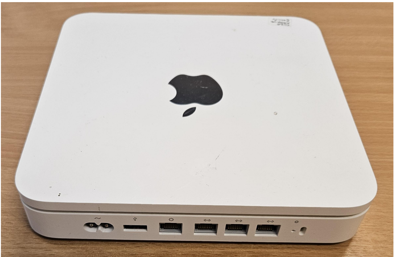
Figure 2: Apple Time Capsule, rear view.