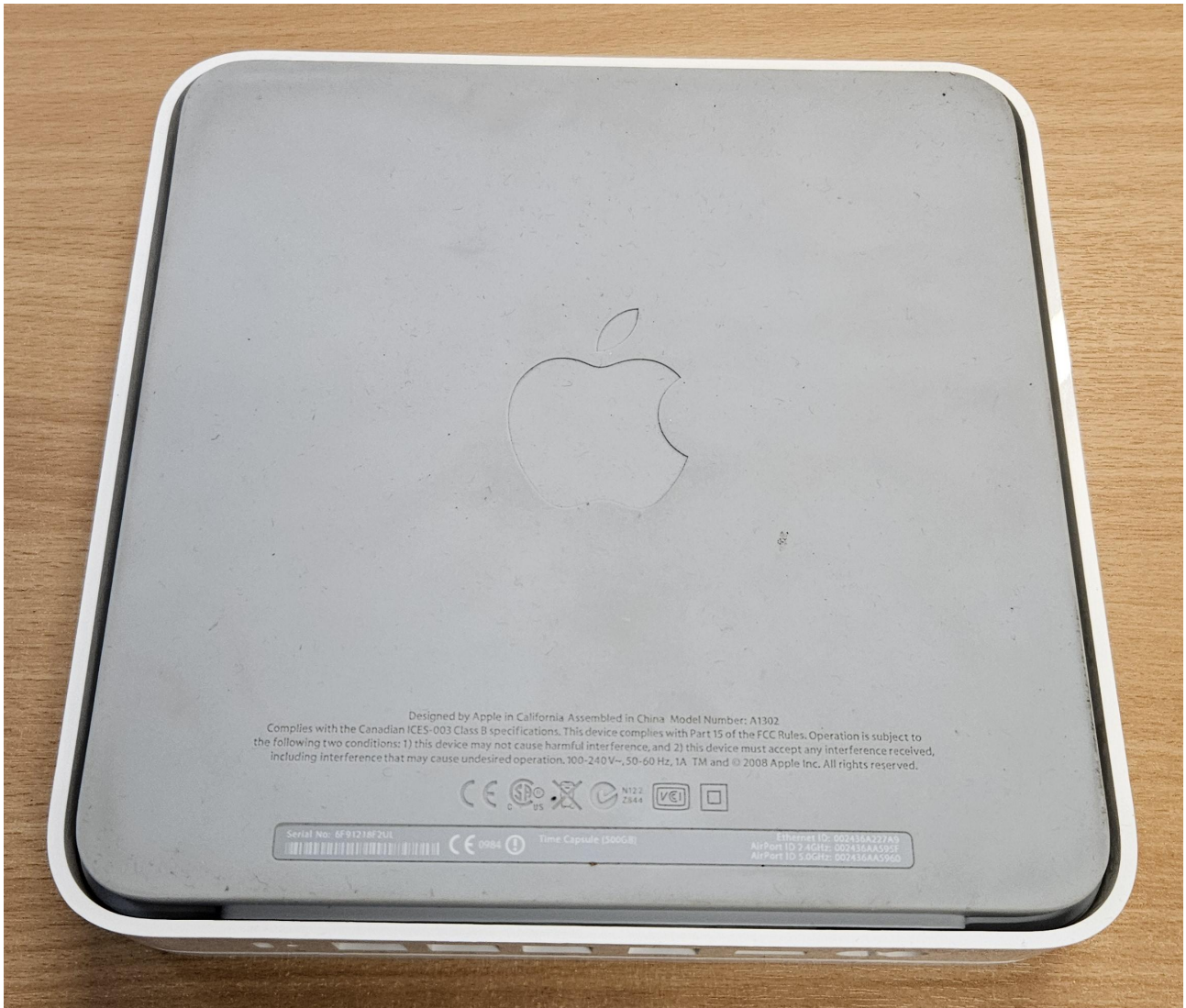
Figure 4: Apple Time Capsule, underneath.