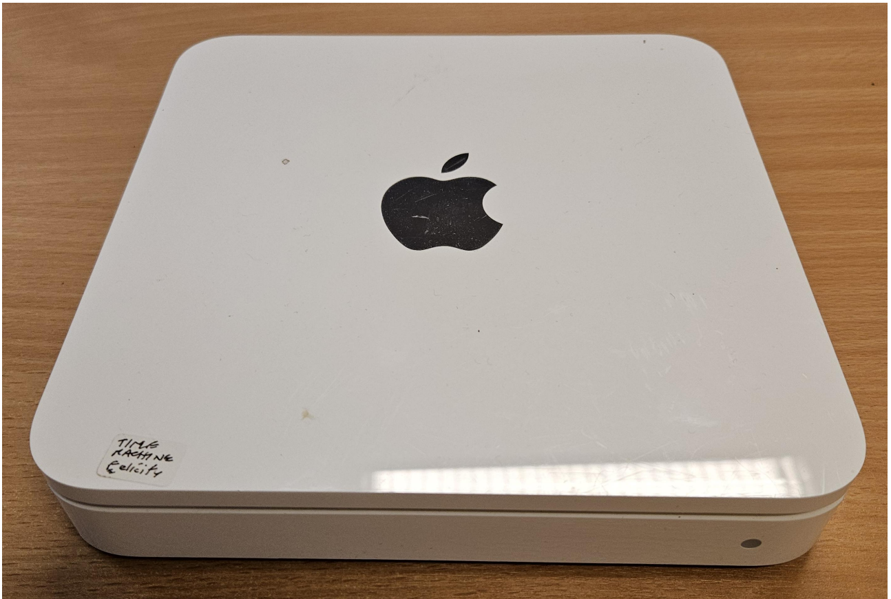
Figure 1: Apple Time Capsule, front view.