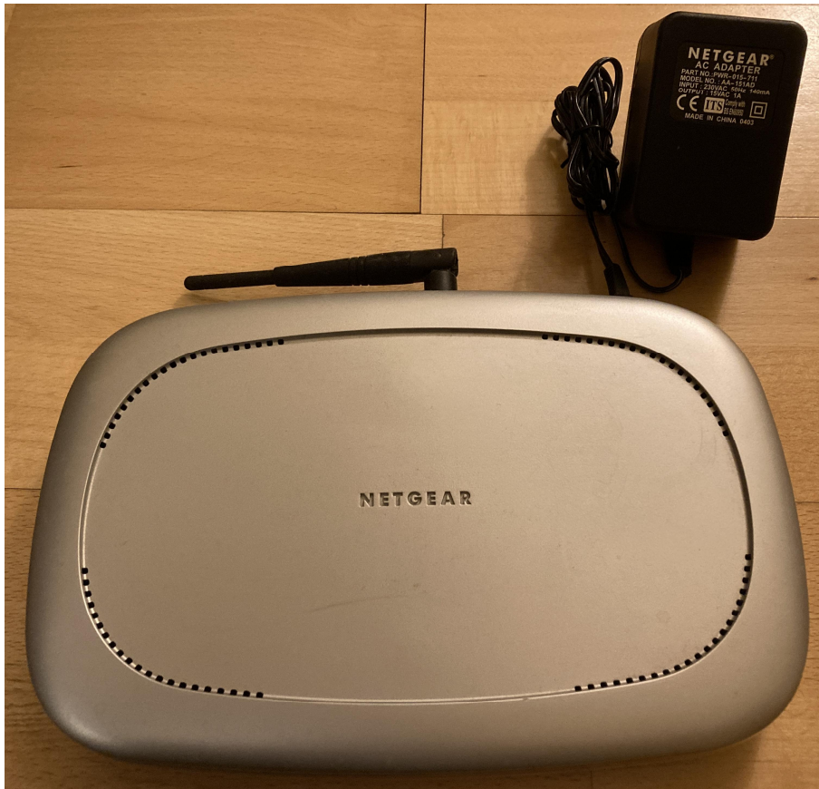
Figure 1: Netgear DG824M top view