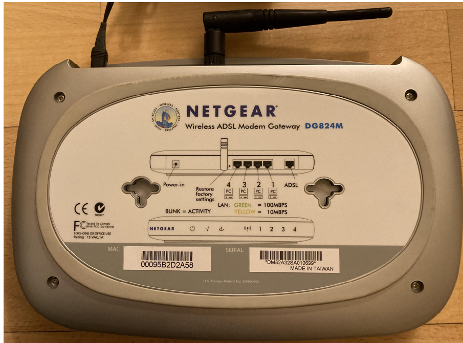
Figure 4: Netgear DG824M bottom view