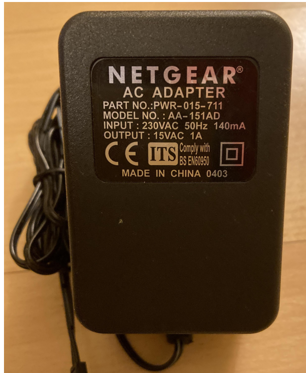
Figure 6: Netgear DG824M power supply unit