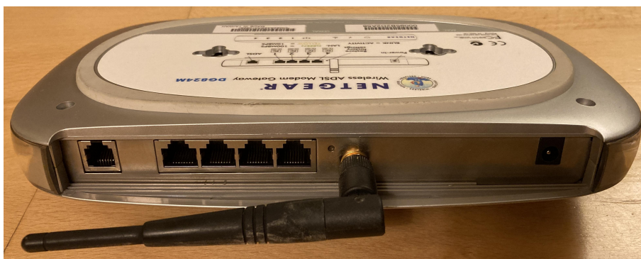
Figure 3: Netgear DG824M rear view