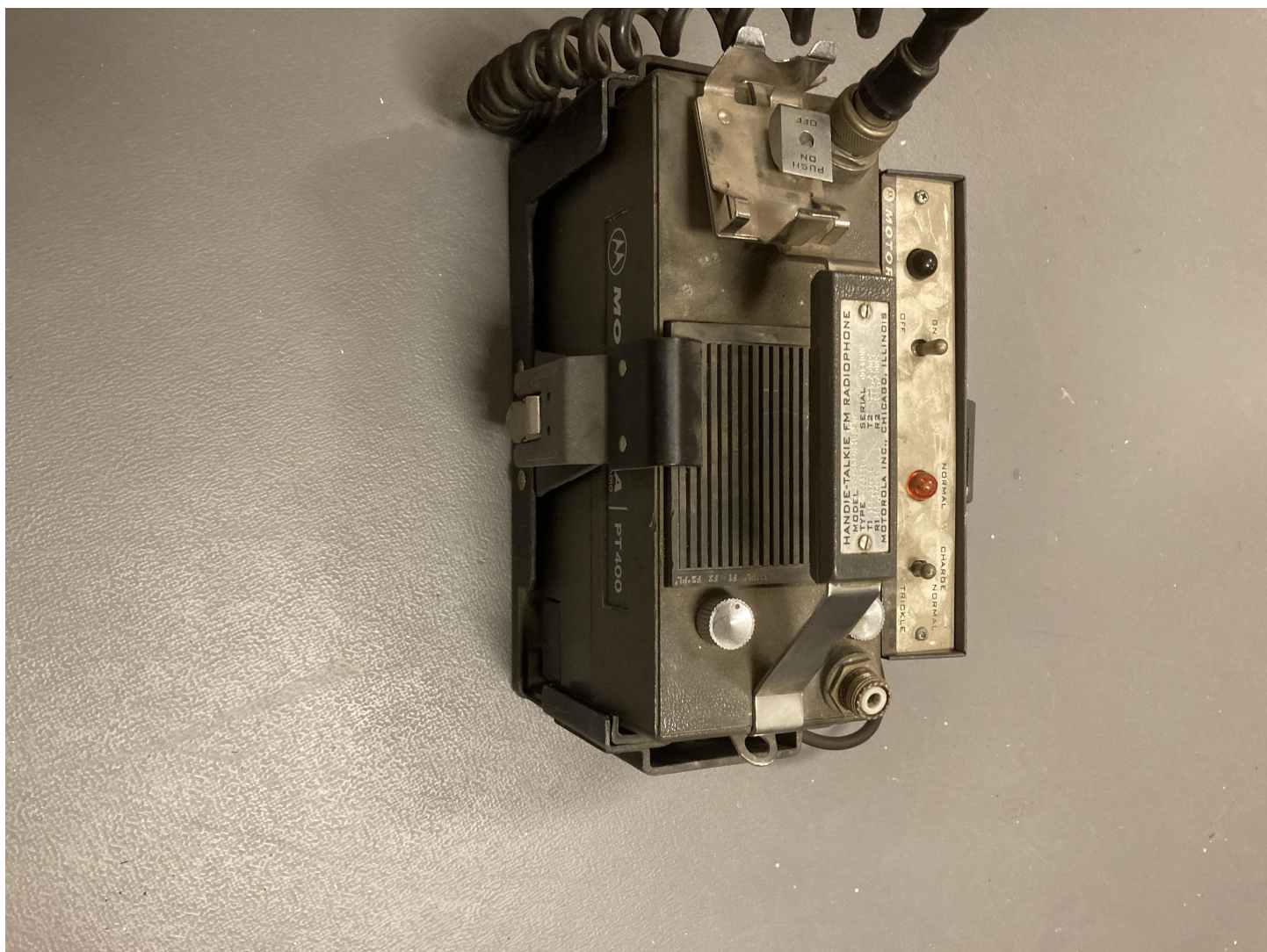
Figure 2: Motorola PT400 left three-quarter view