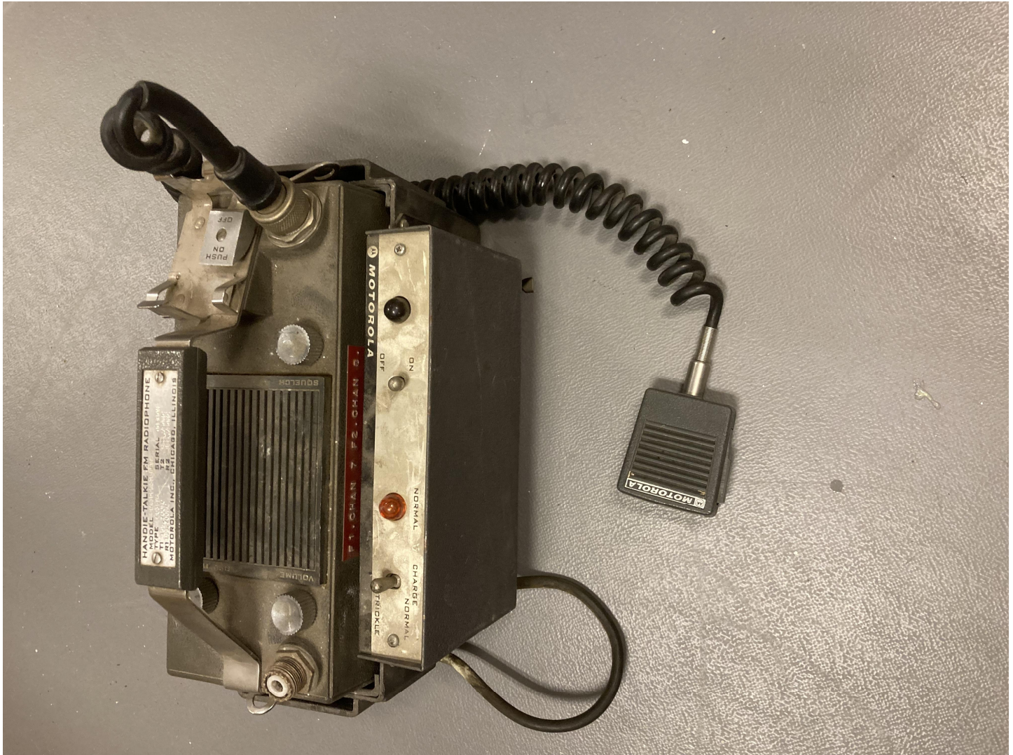
Figure 1: Motorola PT400 right three-quarter view