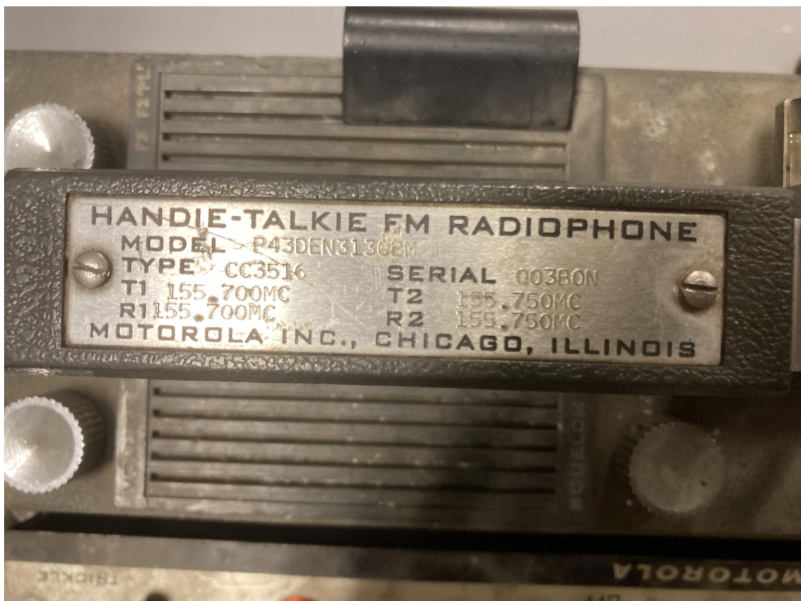
Figure 4: Motorola PT400 manufacturing label