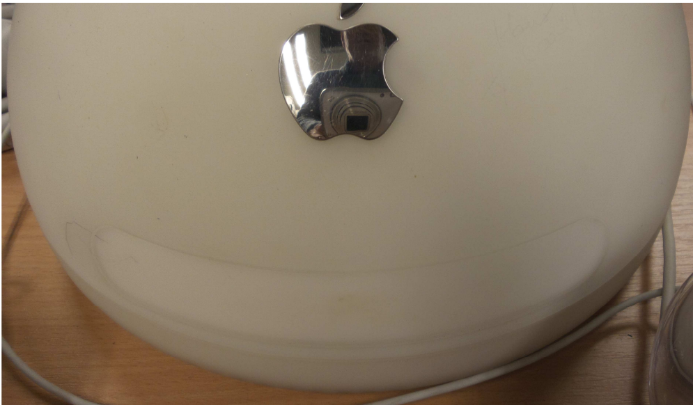
Figure 11: Apple iMac G4 base, front view showing DVD drawer