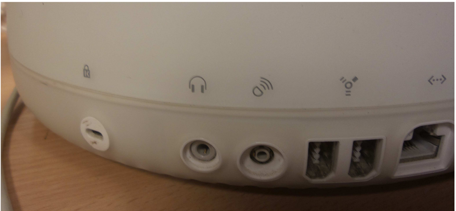
Figure 14: Apple iMac G4, closeup of left rear of base