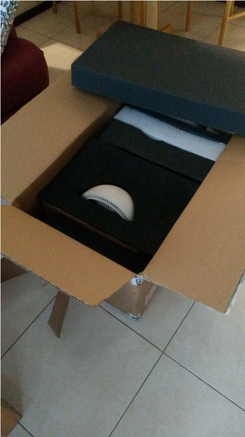
Figure 2: Apple iMac G4 in packaging