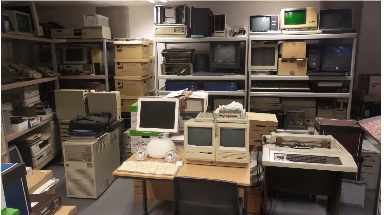
Figure 4: Apple iMac G4 safely in the Collection's Archive Room