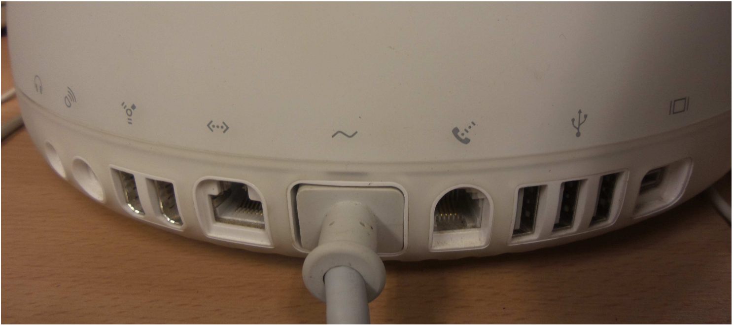
Figure 13: Apple iMac G4 rear view of base