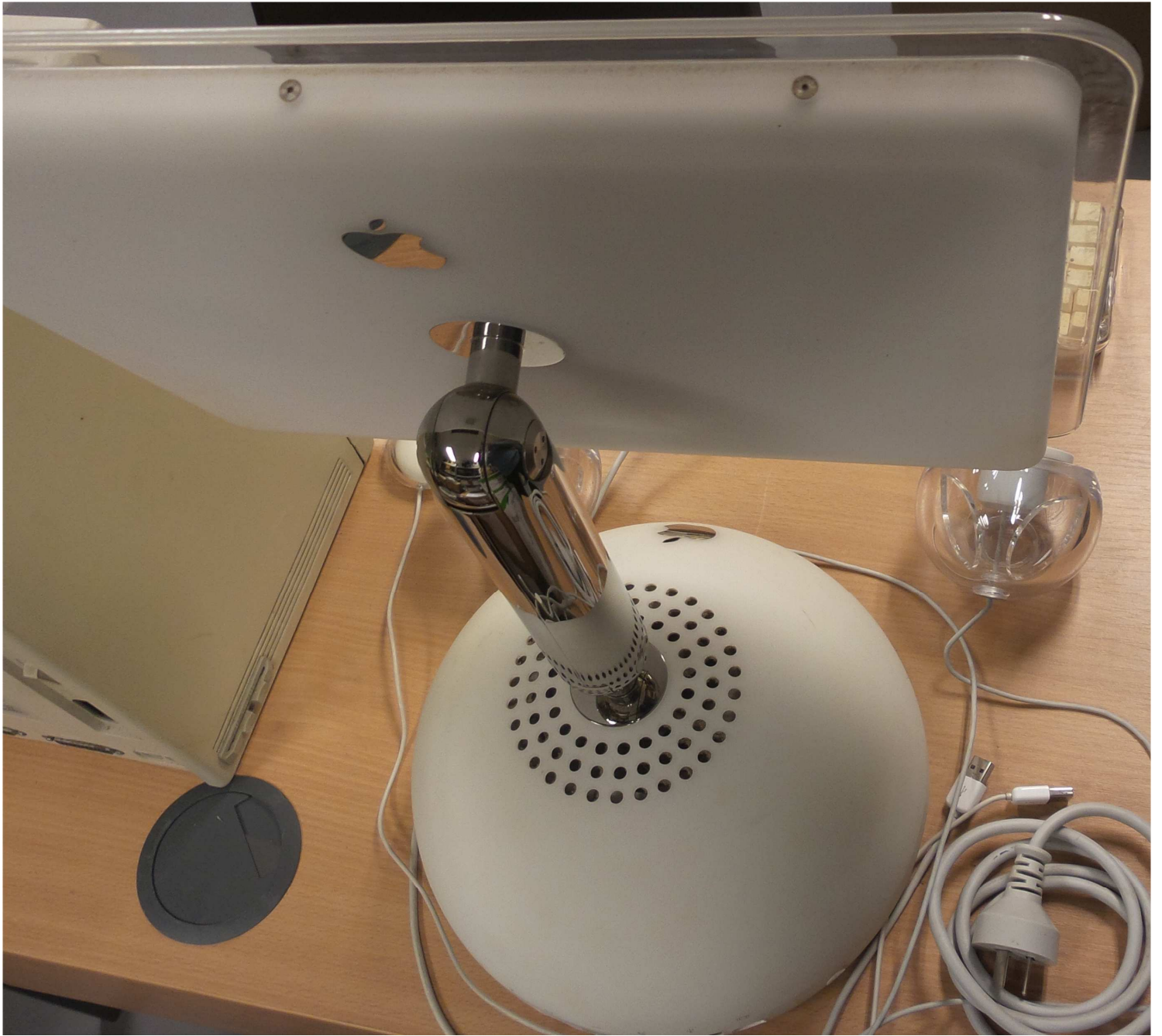
Figure 12: Apple iMac G4 rear view