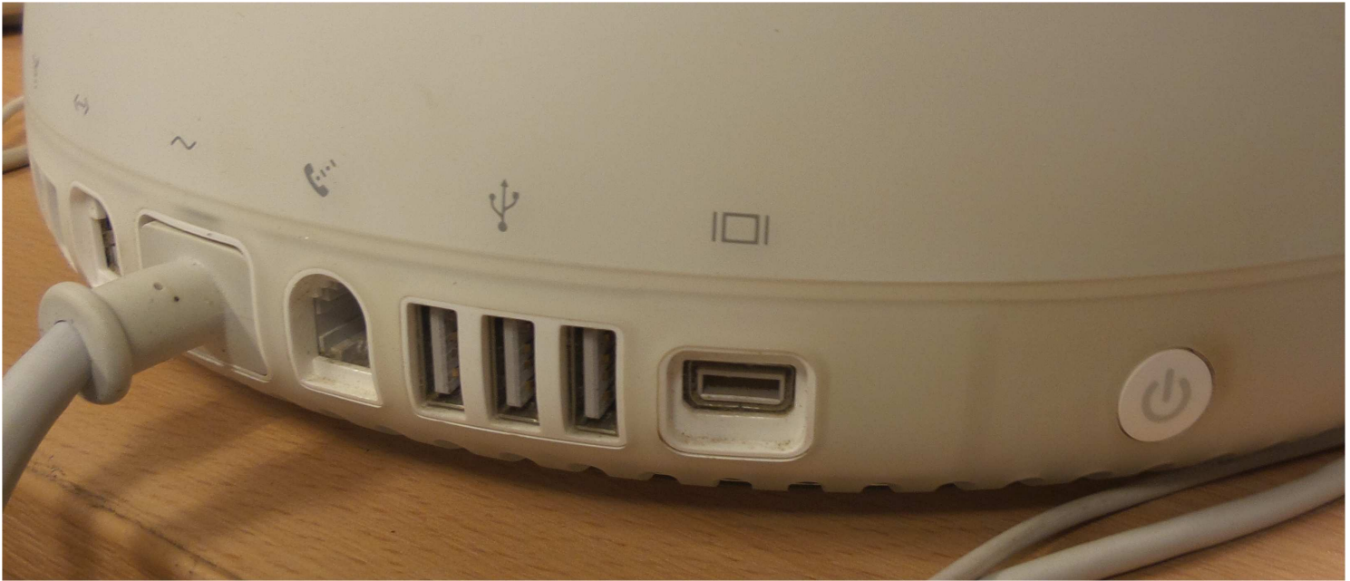
Figure 15: Apple iMac G4, closeup of right rear of base