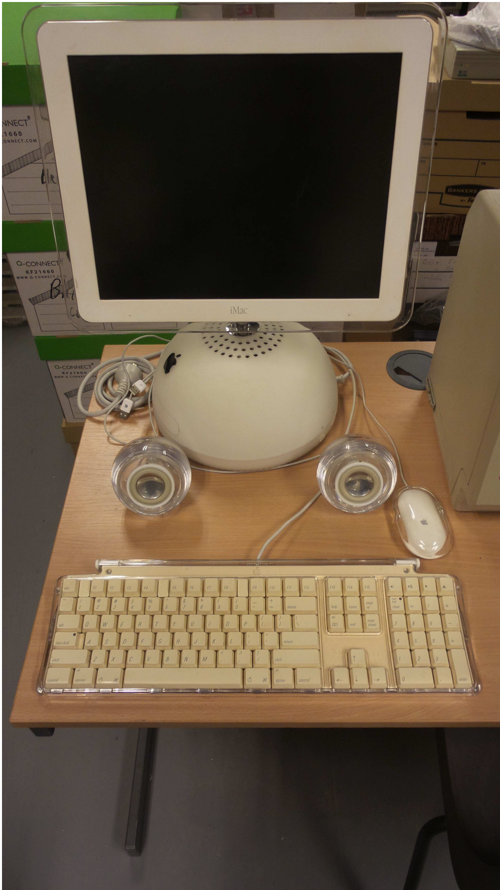
Figure 6: Apple iMac G4 front view