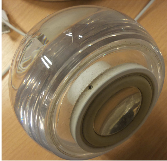
Figure 10: Apple iMac G4 speaker