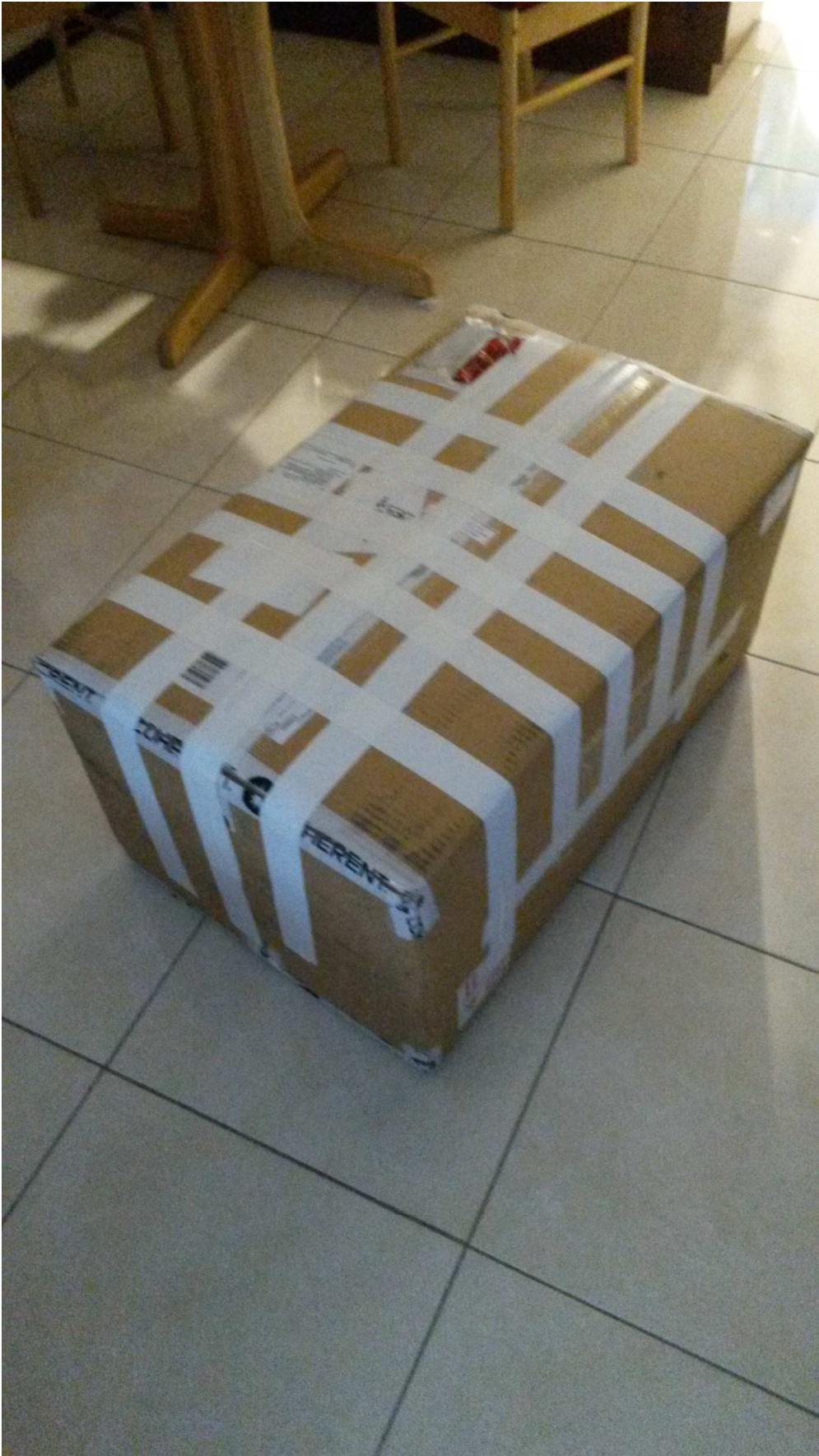
Figure 3: Apple iMac G4 packaged for transport