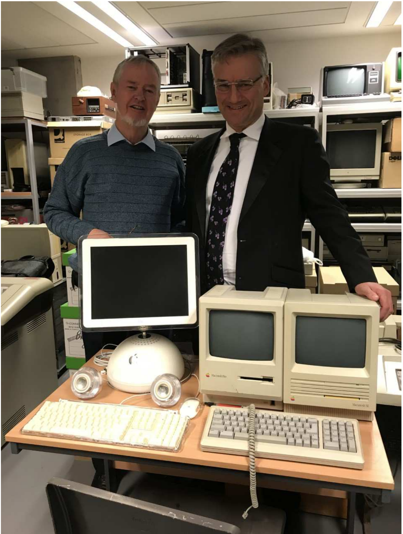
Figure 5: Trinity College Dublin's Provost Patrick Prendergast visiting the Collection on 8-Nov-2019 (Brian Coghlan at left)