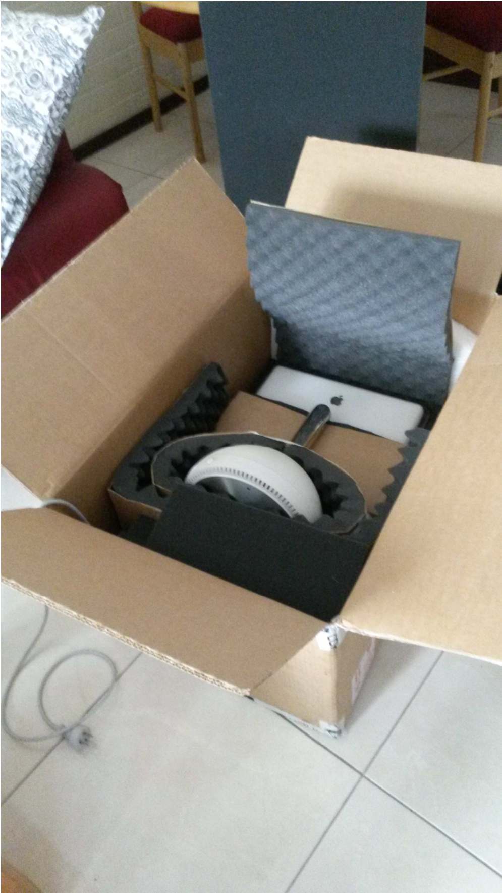
Figure 1: Apple iMac G4 base and display packaging