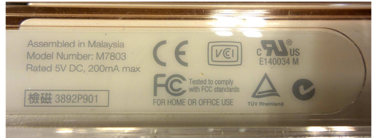
Figure 8: Apple iMac G4 keyboard manufacturing labels