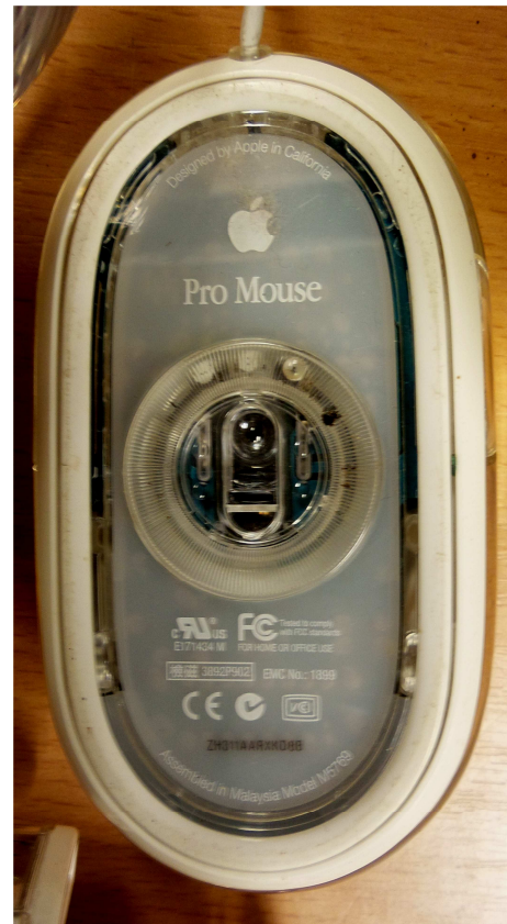
Figure 9: Apple iMac G4 mouse