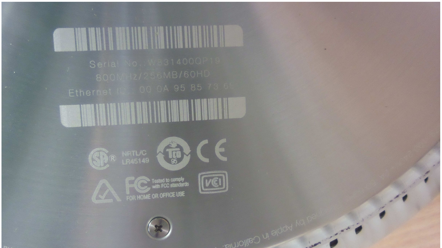
Figure 16: Apple iMac G4, base manufacturing labels "Serial No.: W831400QP19 800MHz/256MB/60HD Ethernet ID: 00 0A 95 85 73 6B" "Made by Apple in California"