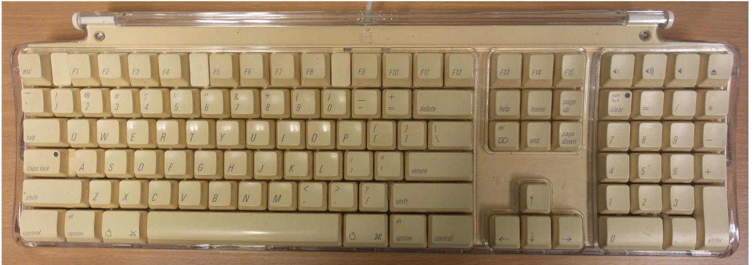
Figure 7: Apple iMac G4 keyboard