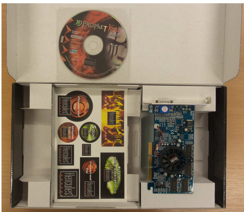
Figure 4: Hercules 4000XT packaging internal view