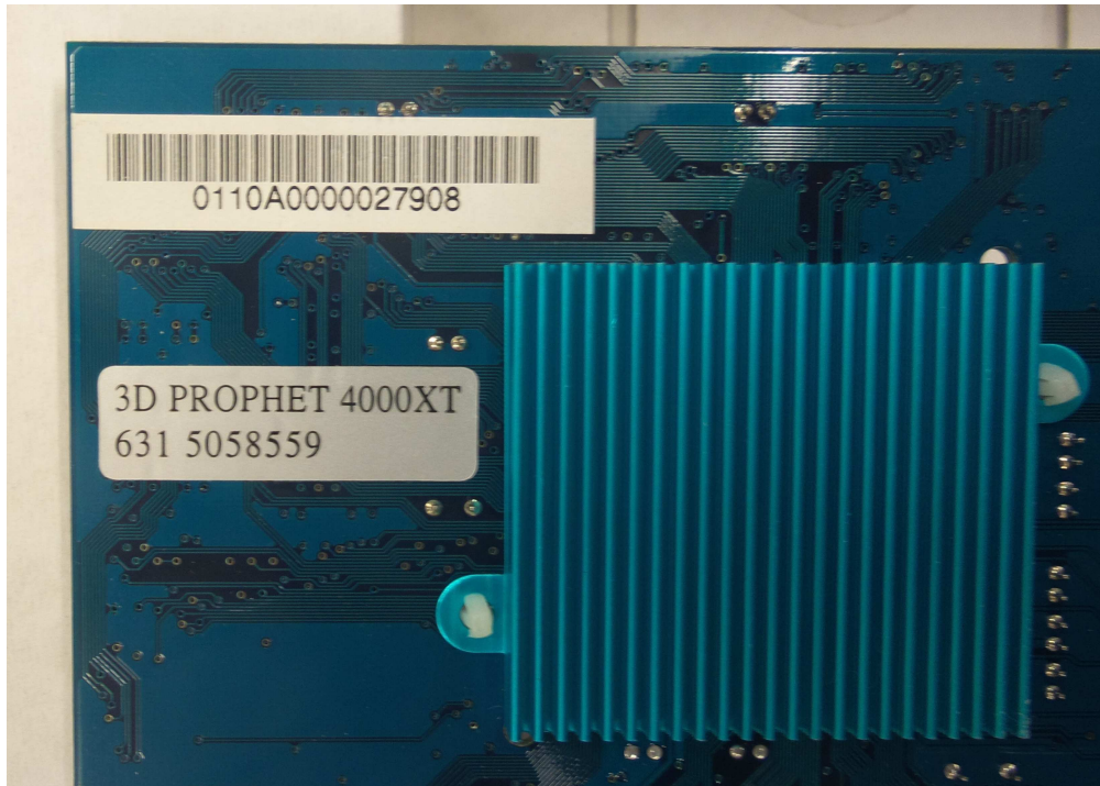
Figure 7: Hercules 4000XT manufacturing labels P/N: 011A0000027908 S/N: 631-5058559