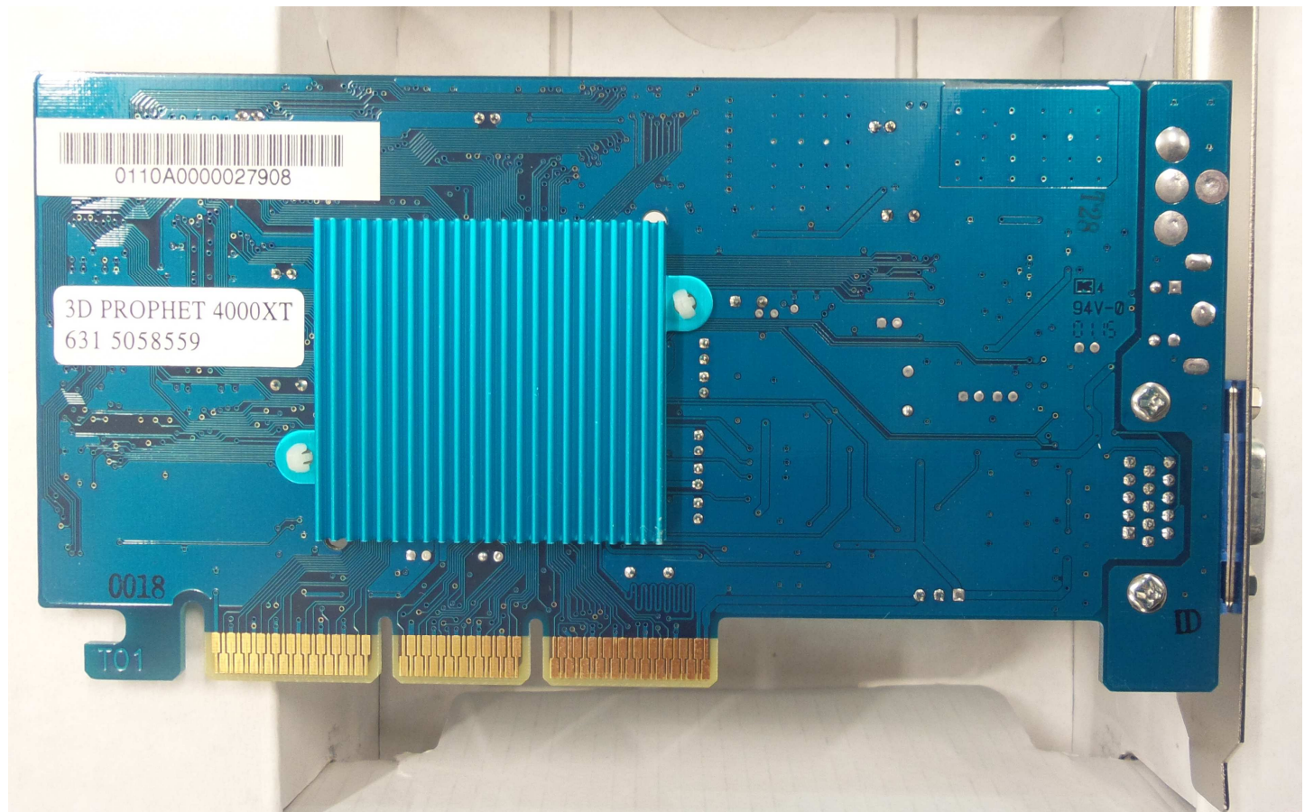
Figure 6: Hercules 4000XT rear view