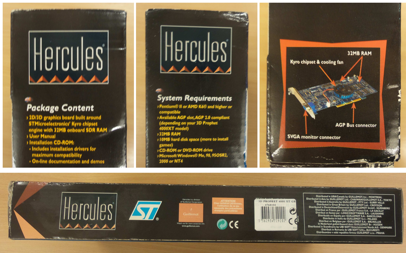
Figure 3: Hercules 4000XT packaging end and side views