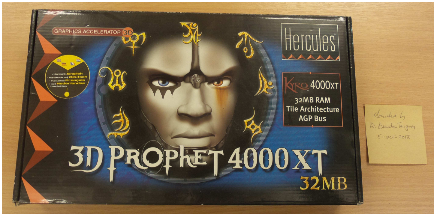
Figure 1: Hercules 4000XT packaging front view