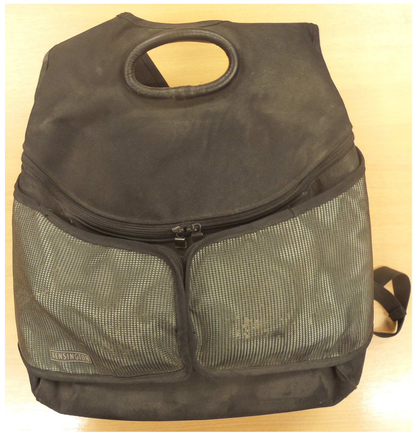
Figure 1: Apple iBook in carrying case, front right three-quarter view