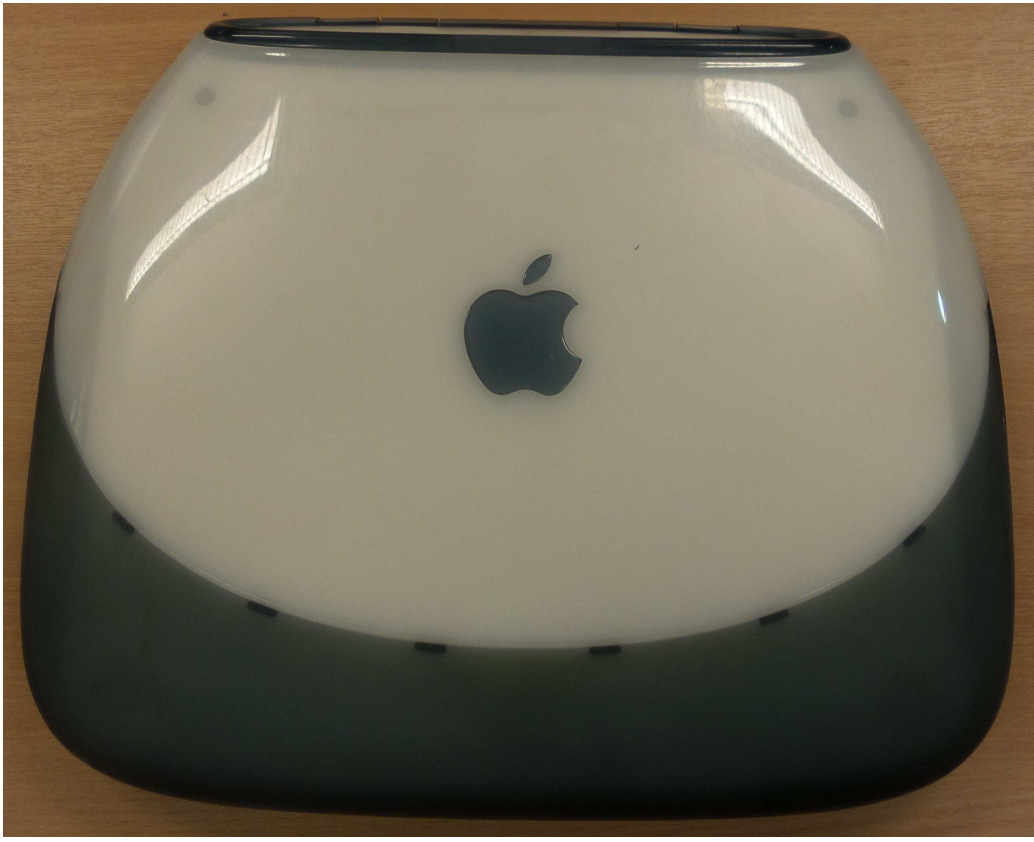
Figure 3: Apple iBook top view