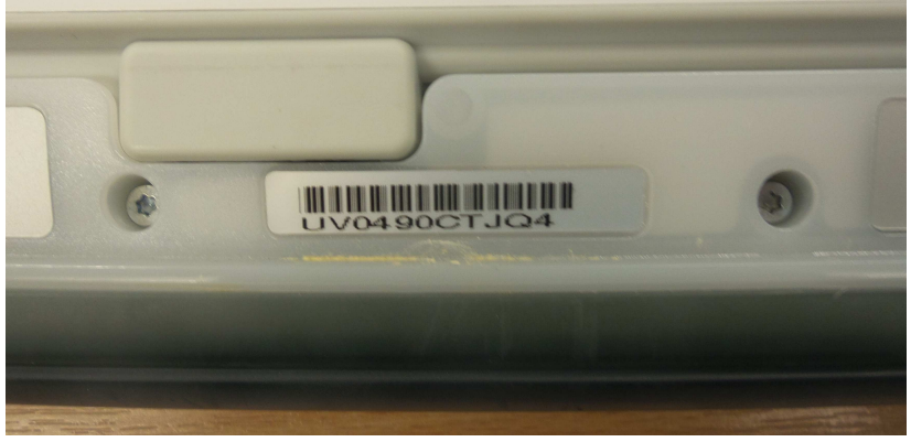
Figure 6: Apple iBook serial number "UV0490CTJQ4"