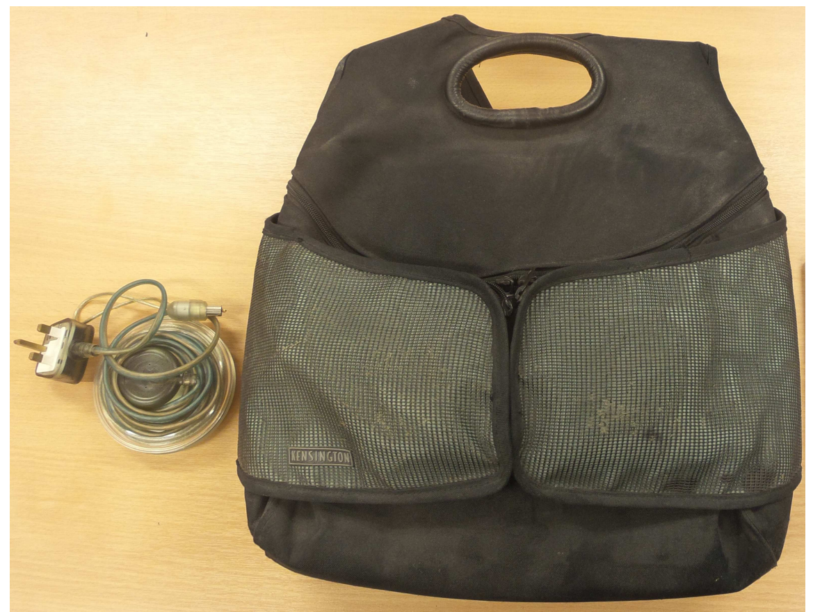
Figure 2: Apple iBook in carrying case with contents of left front pocket