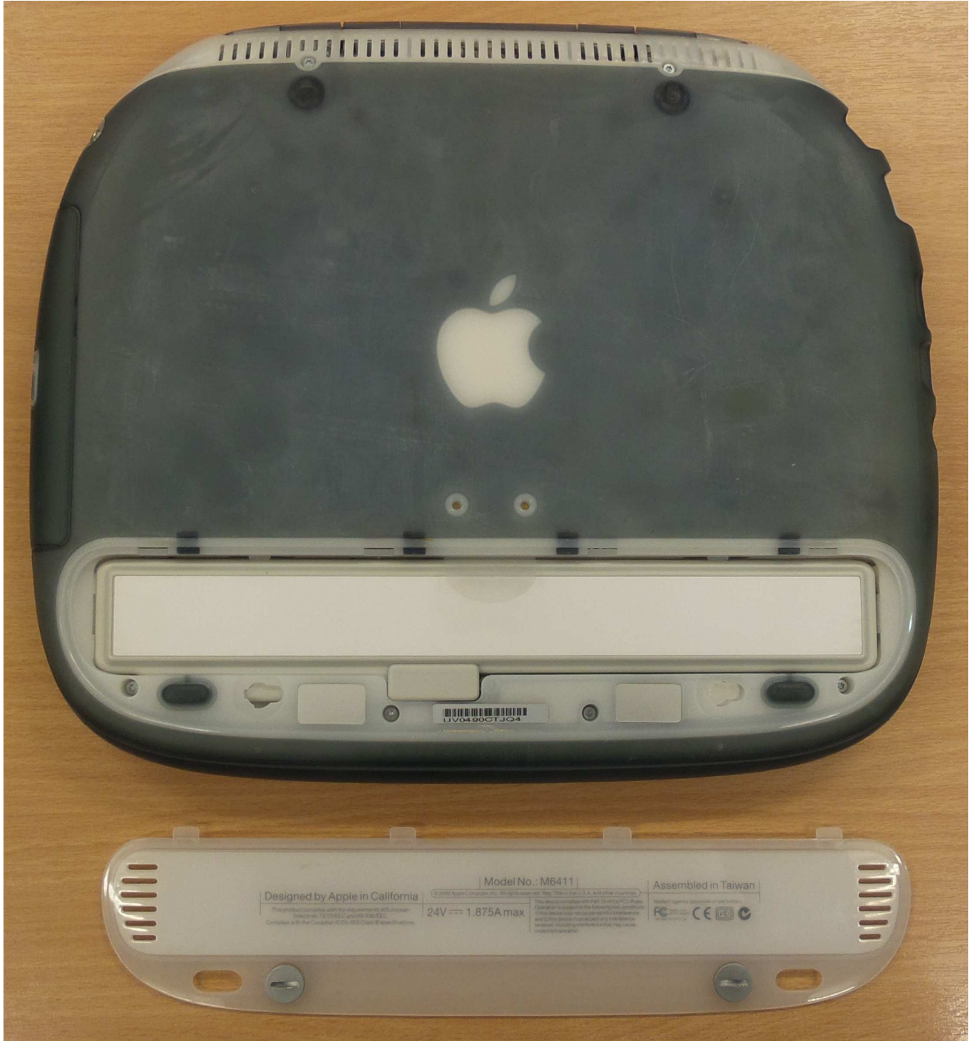
Figure 5: Apple iBook bottom view