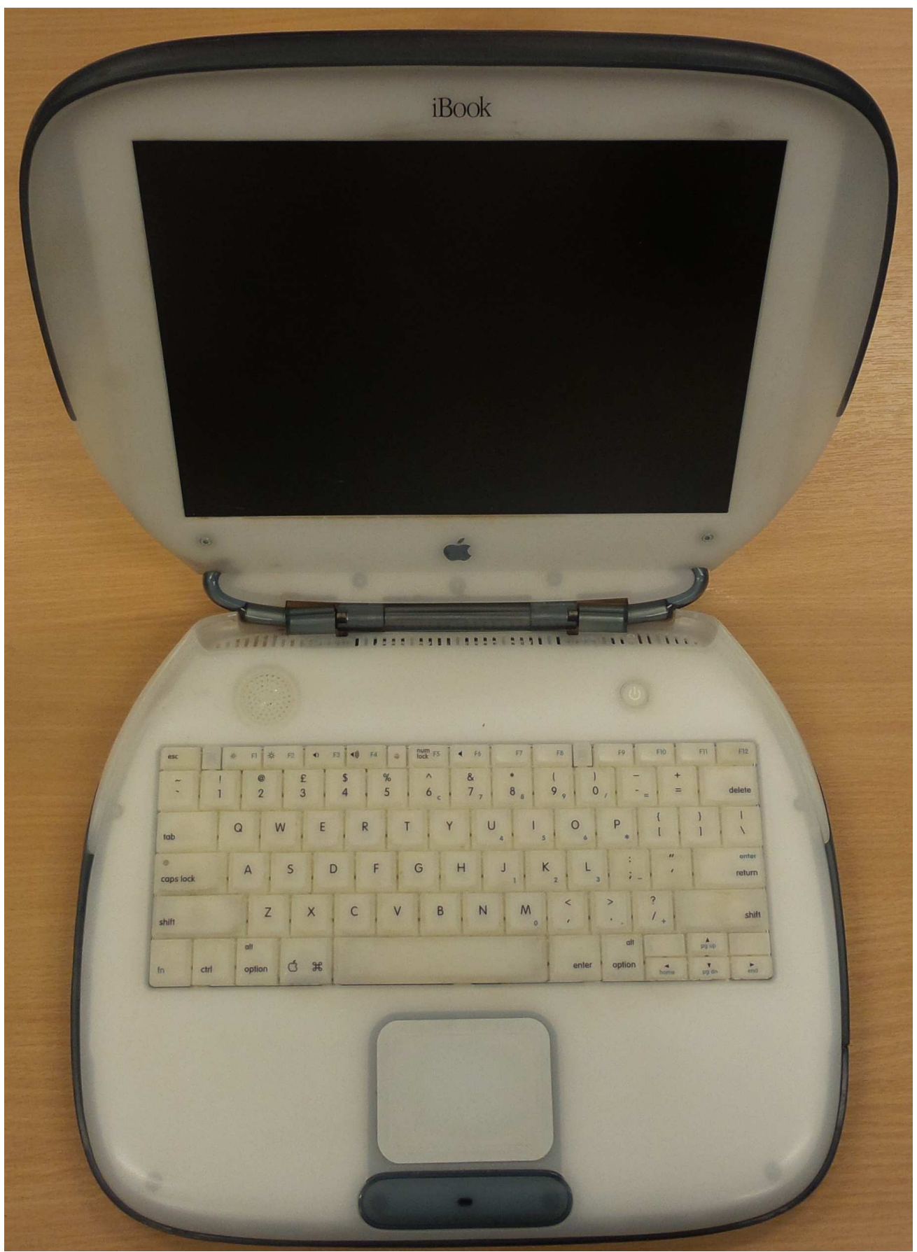
Figure 4: Apple iBook open showing keyboard and screen, top view