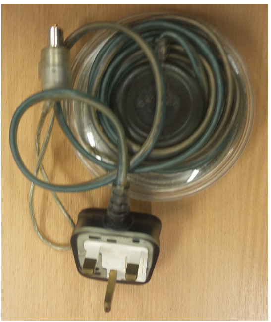
Figure 8: Apple iBook power supply