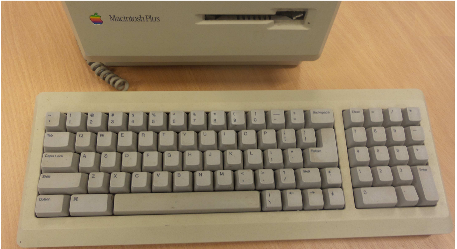
Figure 3: Apple Macintosh Plus keyboard