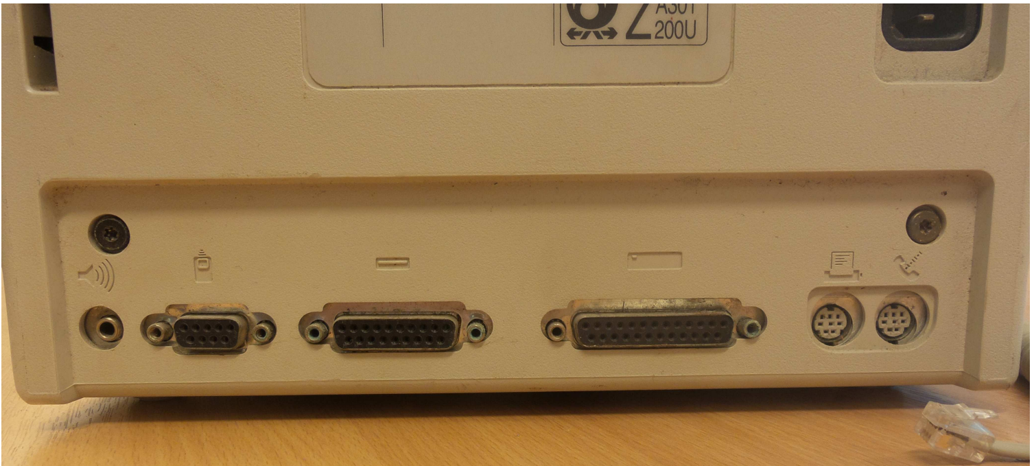
Figure 4: Apple Macintosh Plus rear closeup