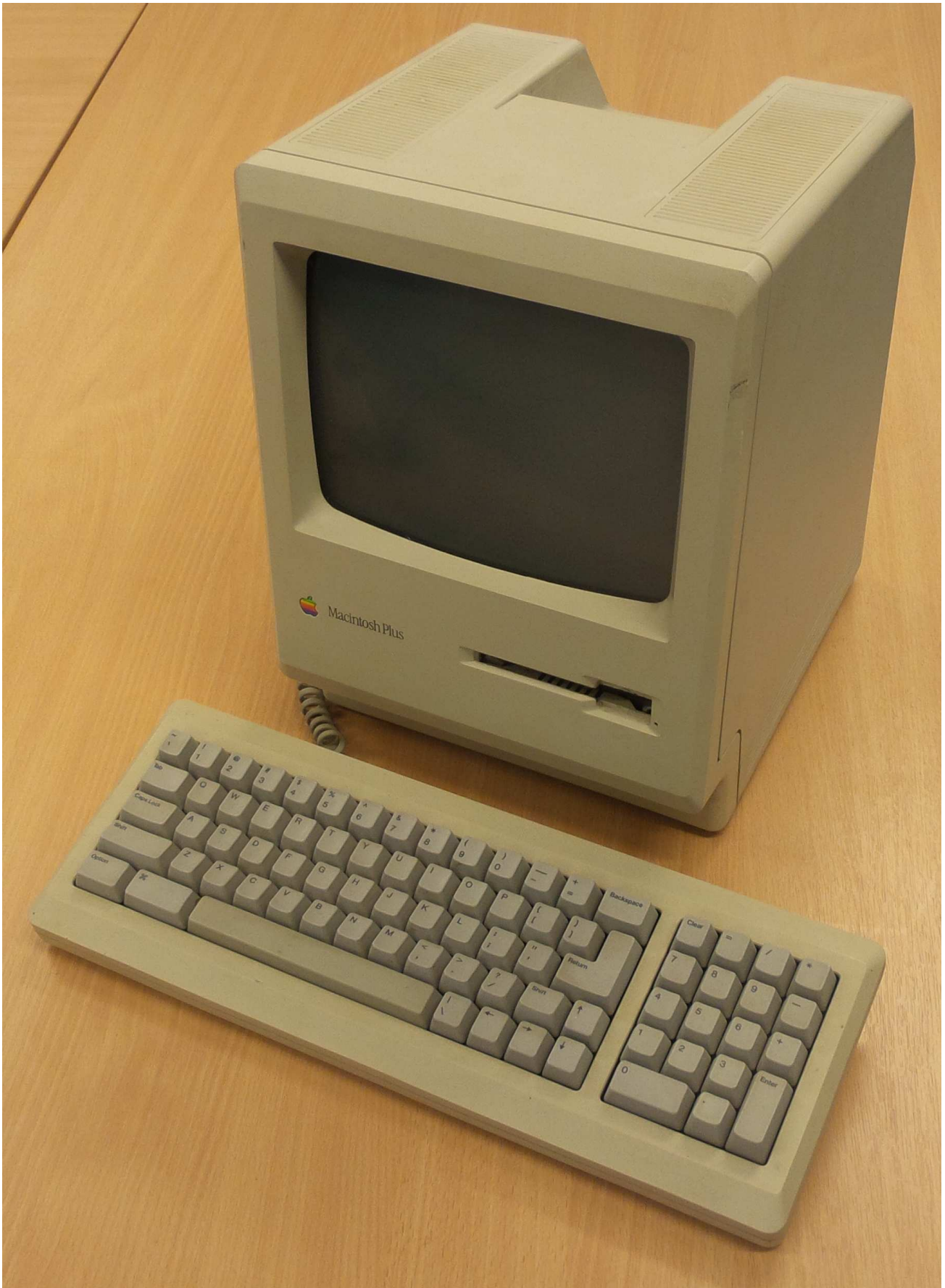
Figure 1: Apple Macintosh Plus top three-quarter view