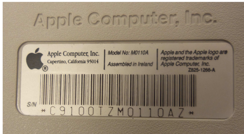
Figure 8: Apple Macintosh Plus keyboard manufacturing label