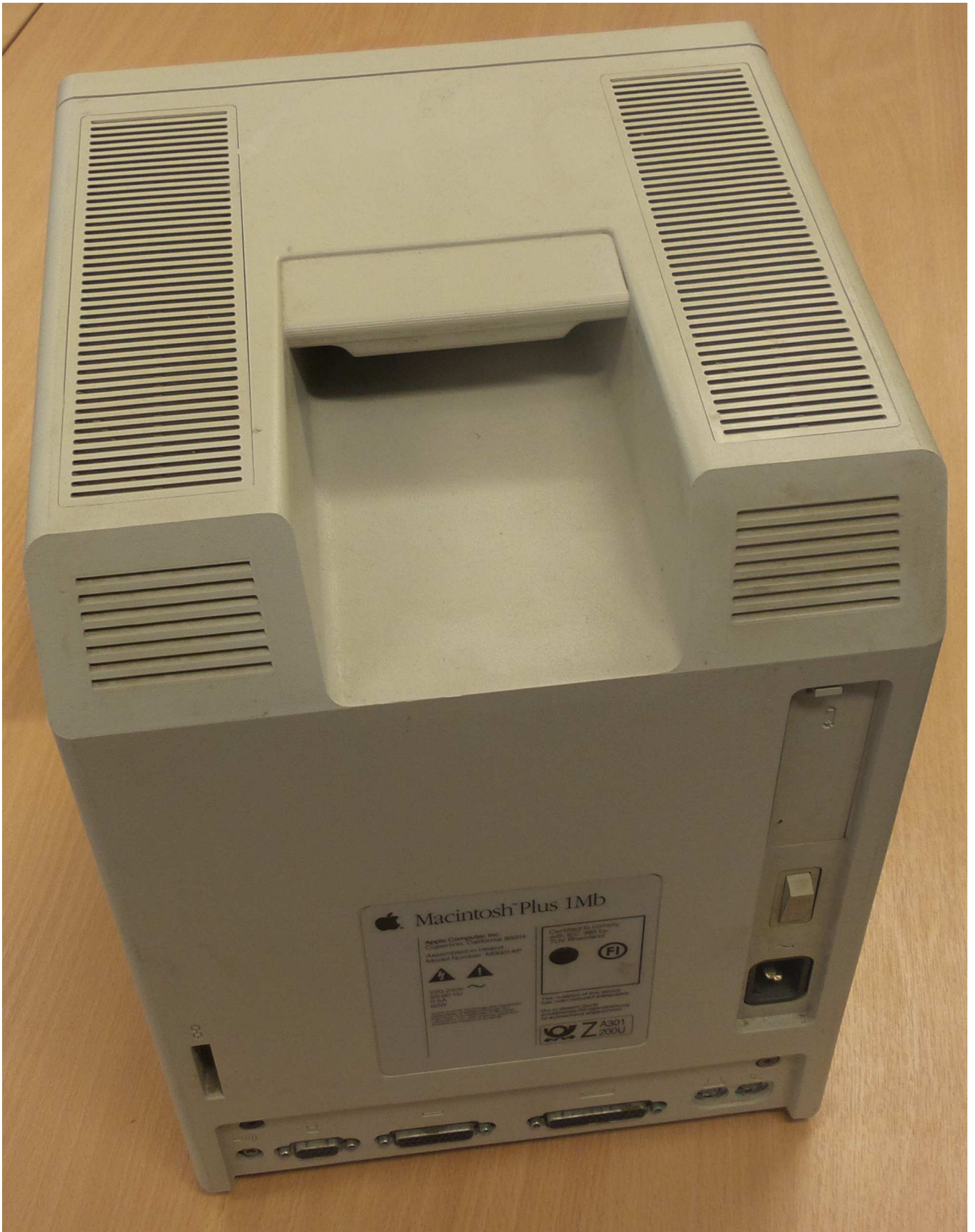
Figure 2: Apple Macintosh Plus top rear view