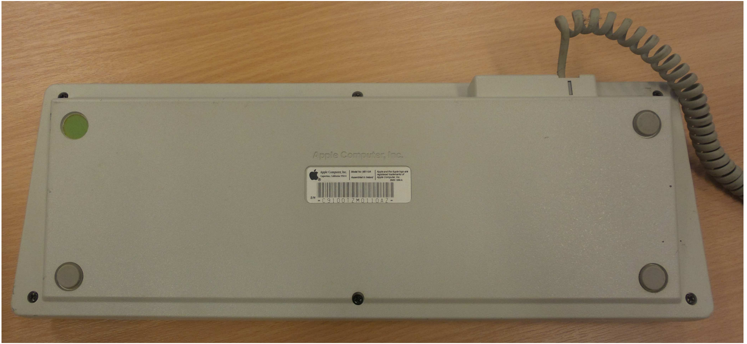
Figure 7: Apple Macintosh Plus keyboard bottom