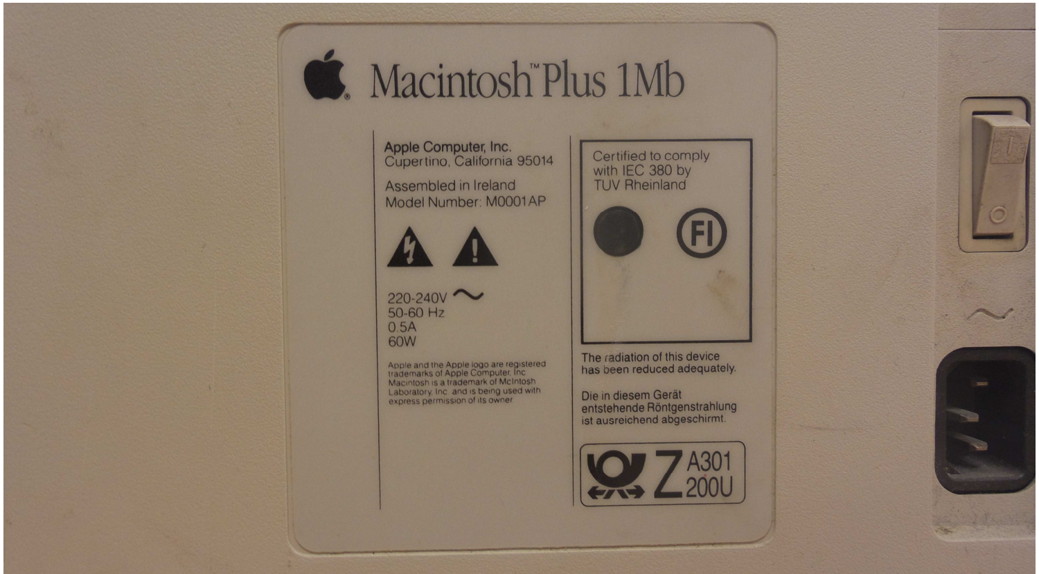
Figure 5: Apple Macintosh Plus manufacturing label Model M0001AP