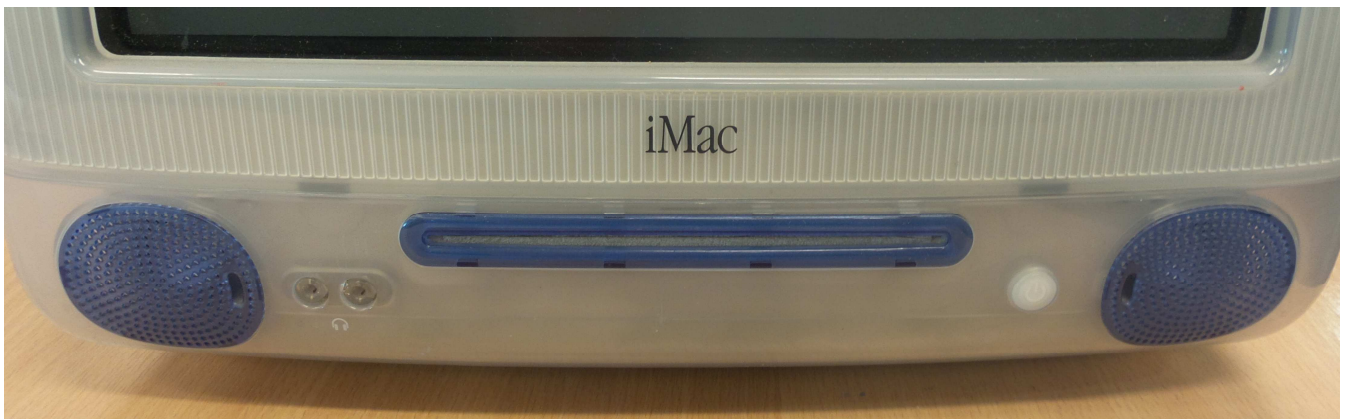
Figure 2: Apple Macintosh iMac front closeup