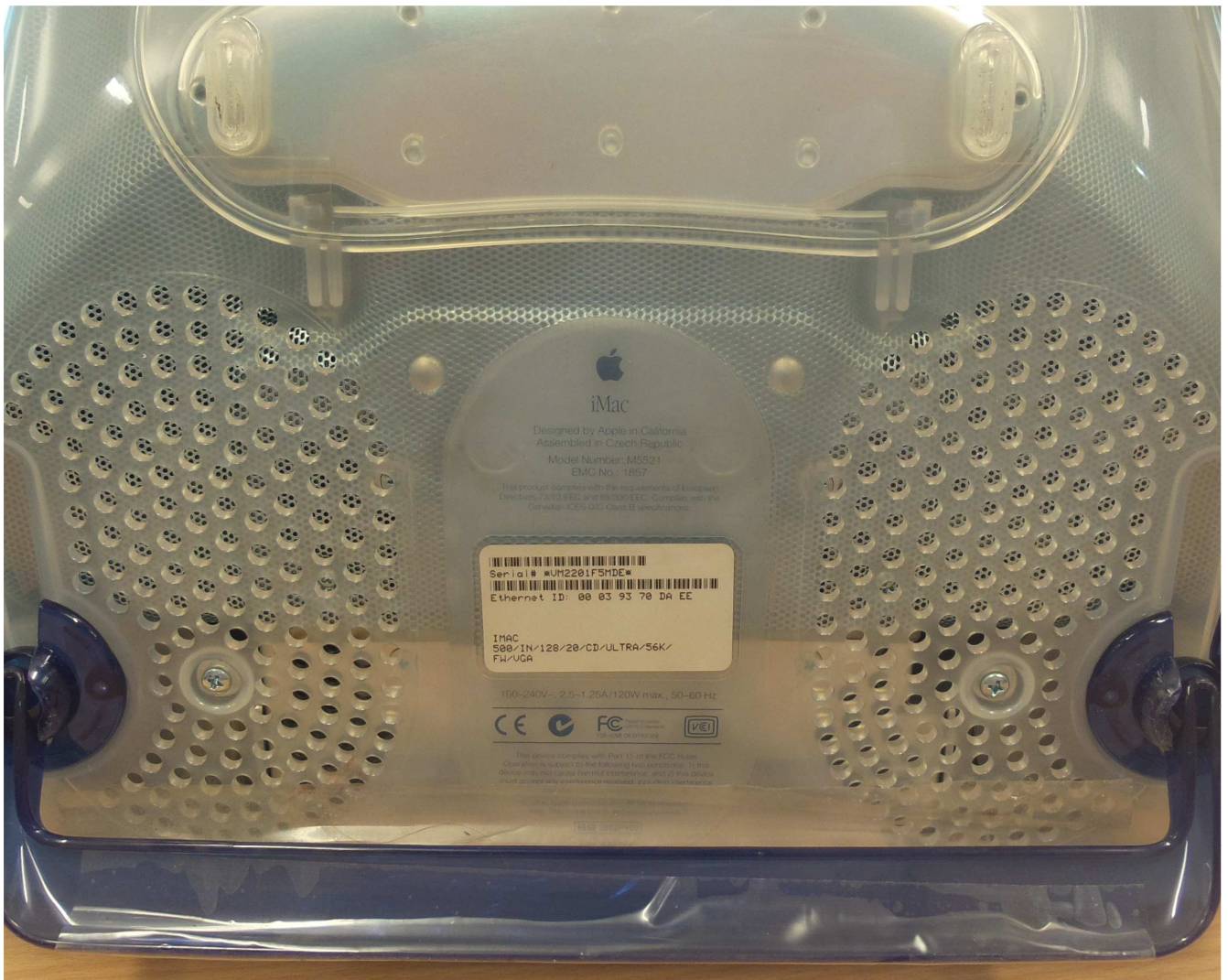
Figure 7: Apple Macintosh iMac bottom view