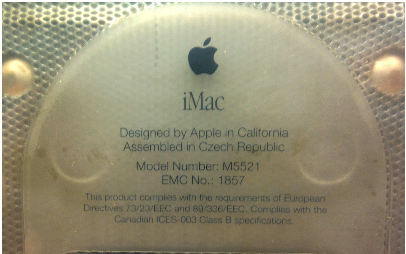
Figure 8: Apple Macintosh iMac manufacturing label