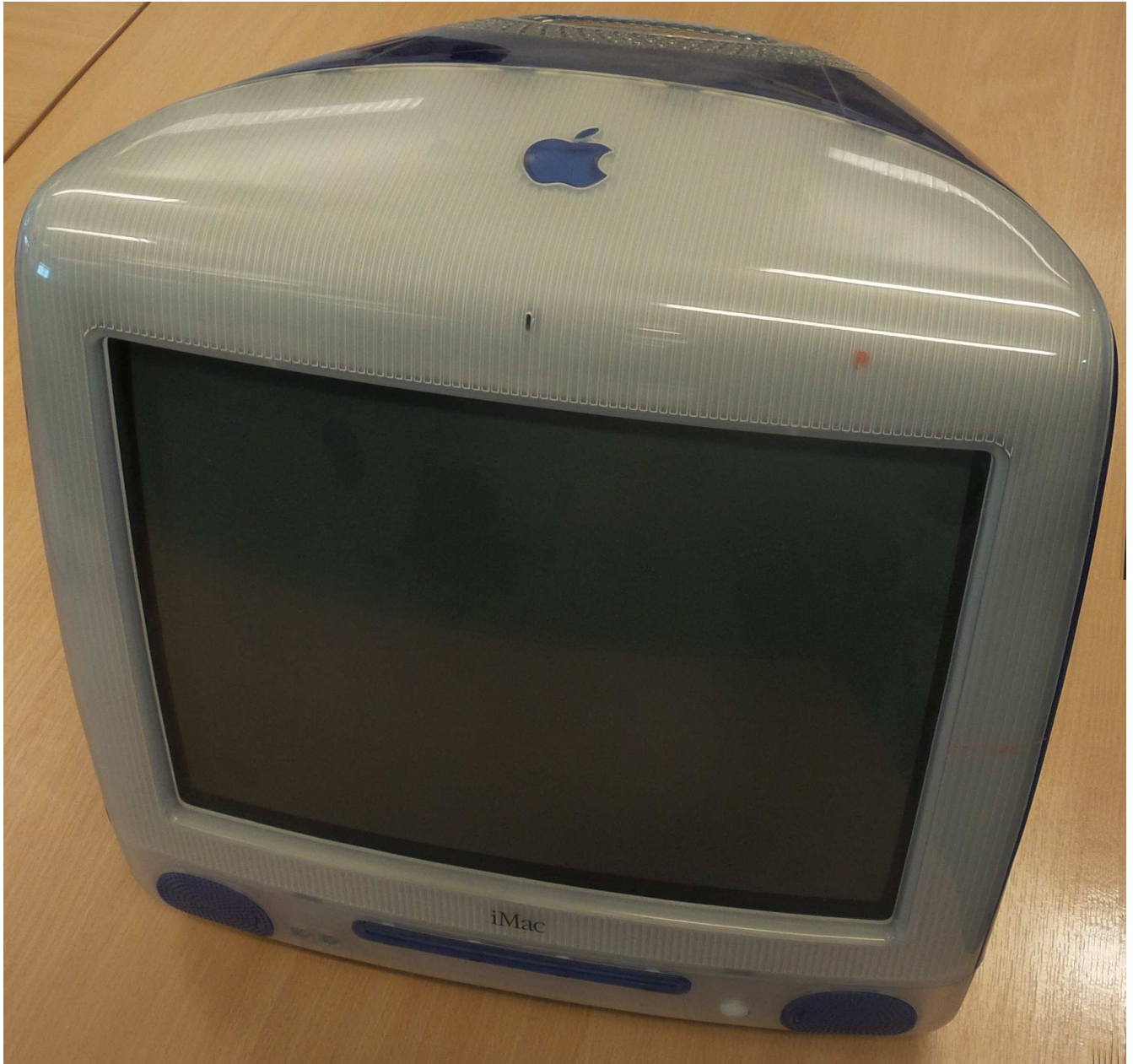
Figure 1: Apple Macintosh iMac front left three-quarter view