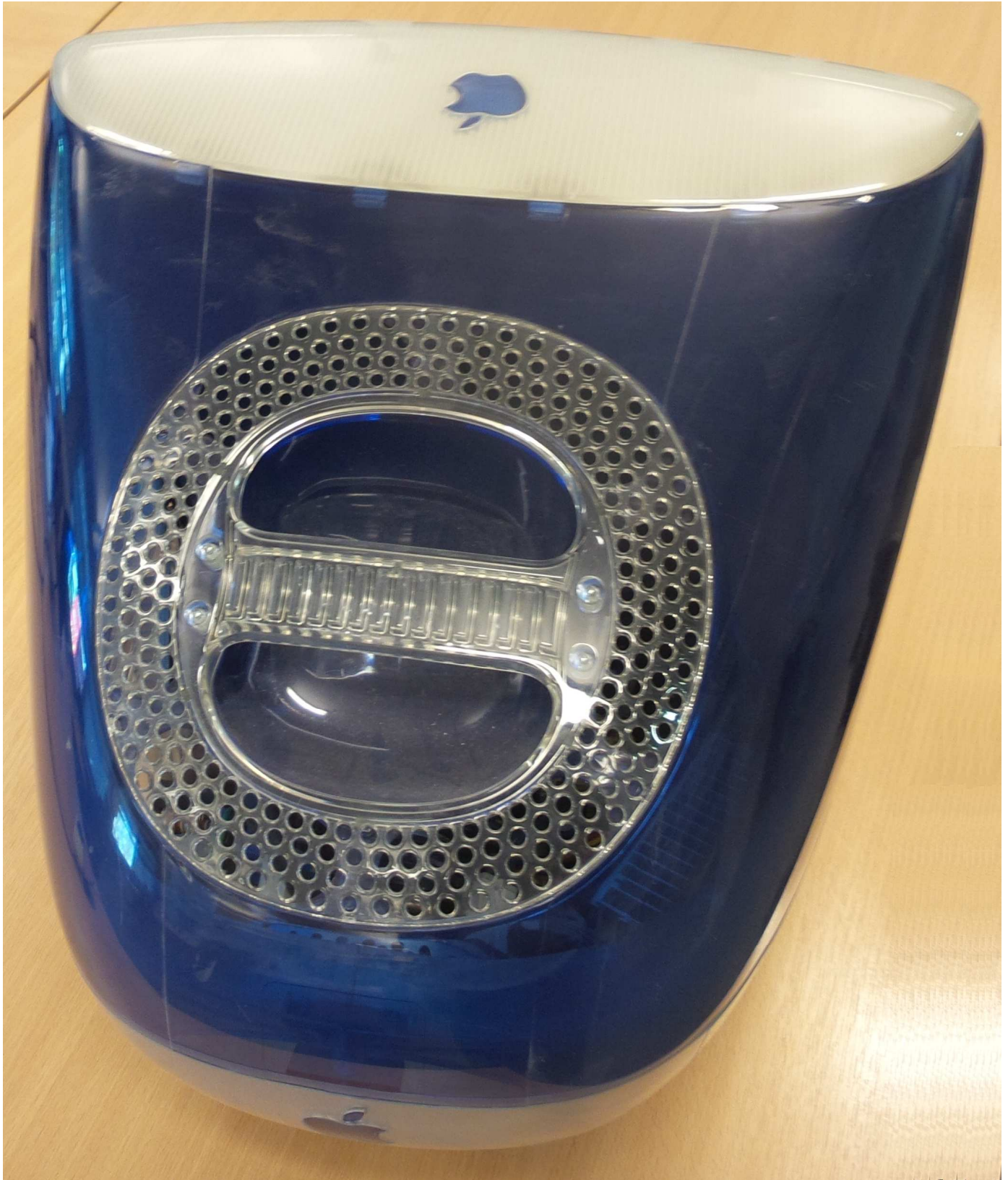
Figure 3: Apple Macintosh iMac rear view