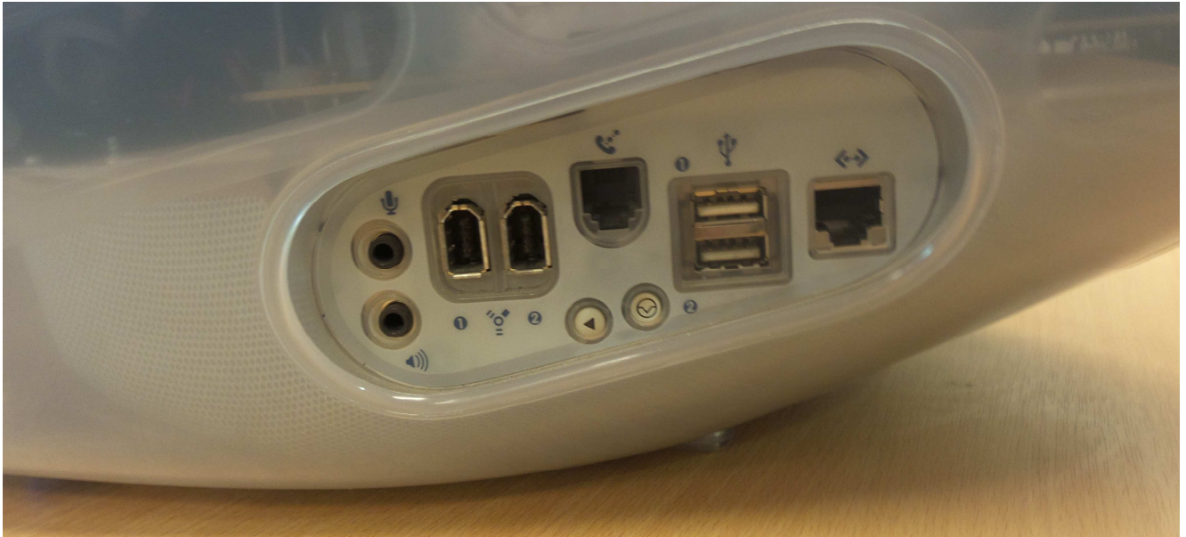
Figure 6: Apple Macintosh iMac I/O ports