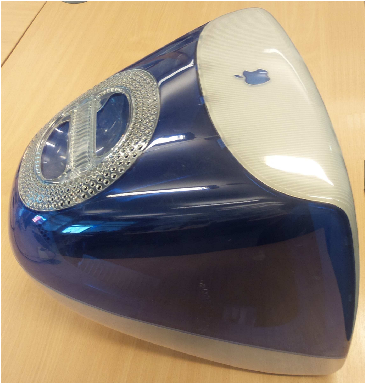
Figure 4: Apple Macintosh iMac right side view