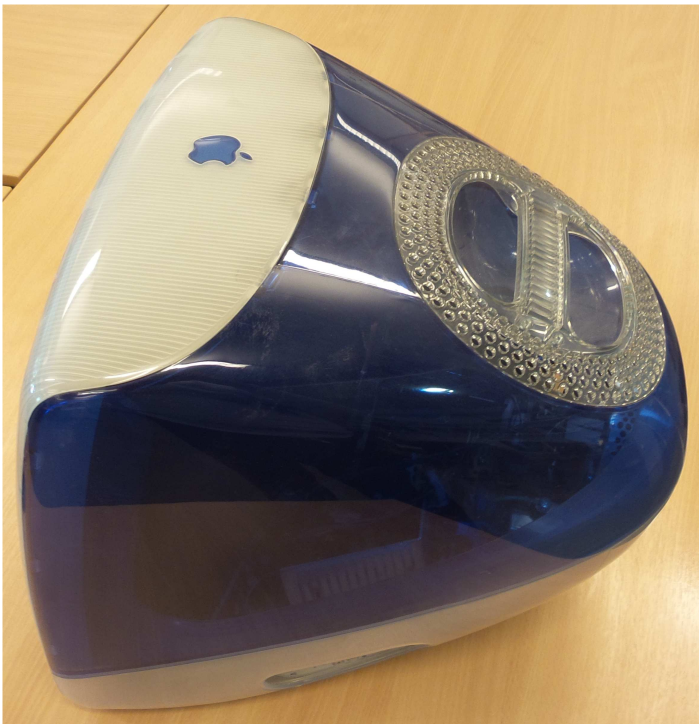
Figure 5: Apple Macintosh iMac left side view