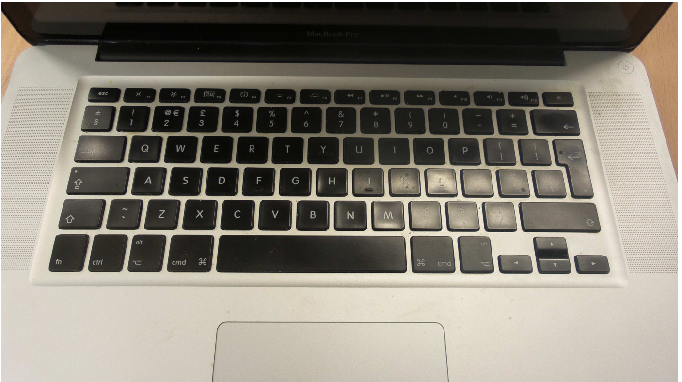
Figure 5: Apple MacBook Pro 5.1 keyboard