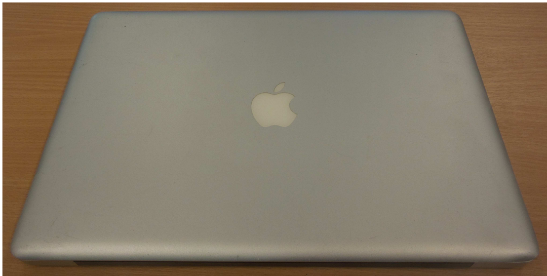
Figure 6: Apple MacBook Pro 5.1 rear view