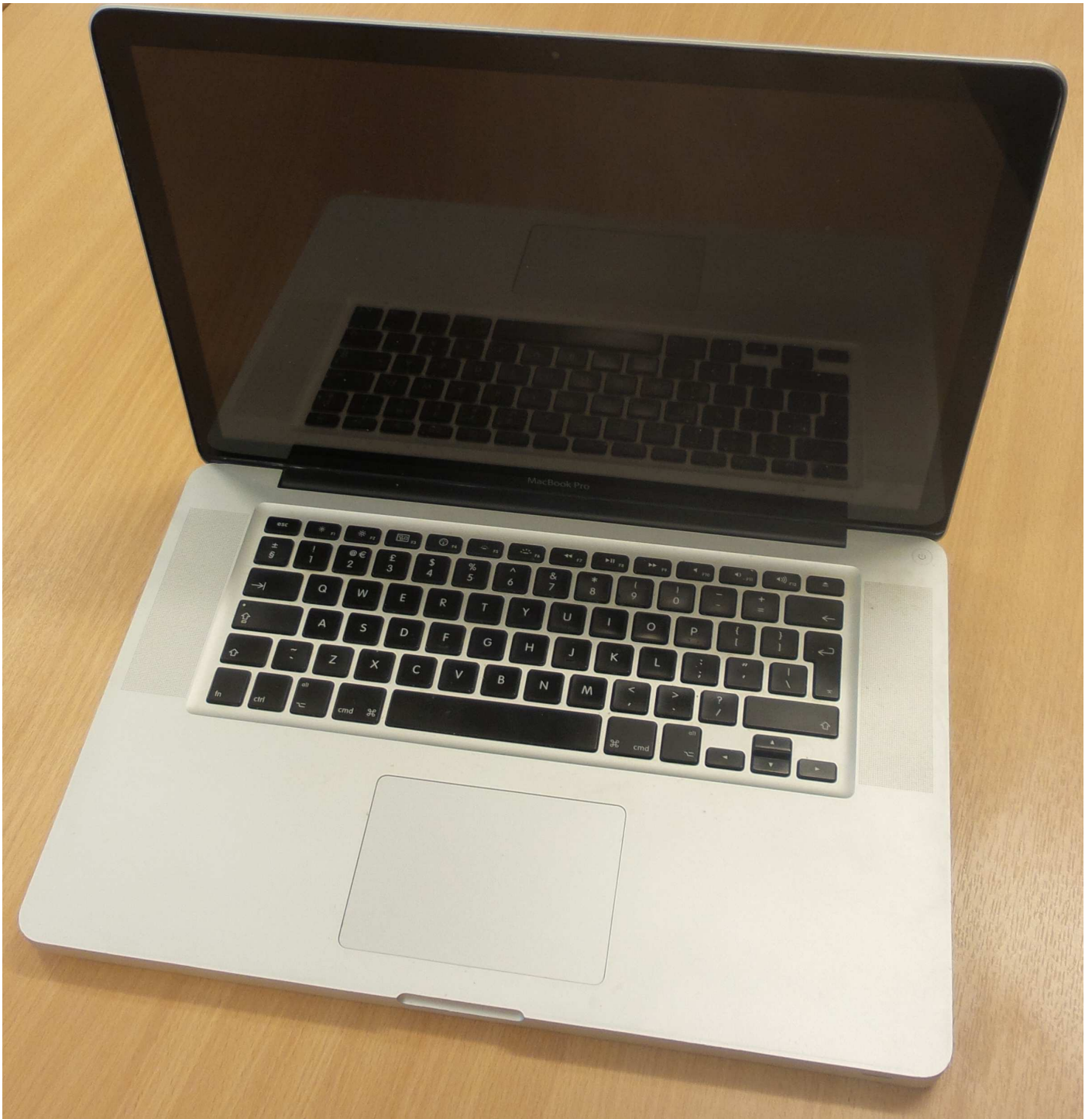
Figure 4: Apple MacBook Pro 5.1 three-quarter view, open