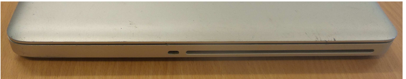
Figure 3: Apple MacBook Pro 5.1 right side view