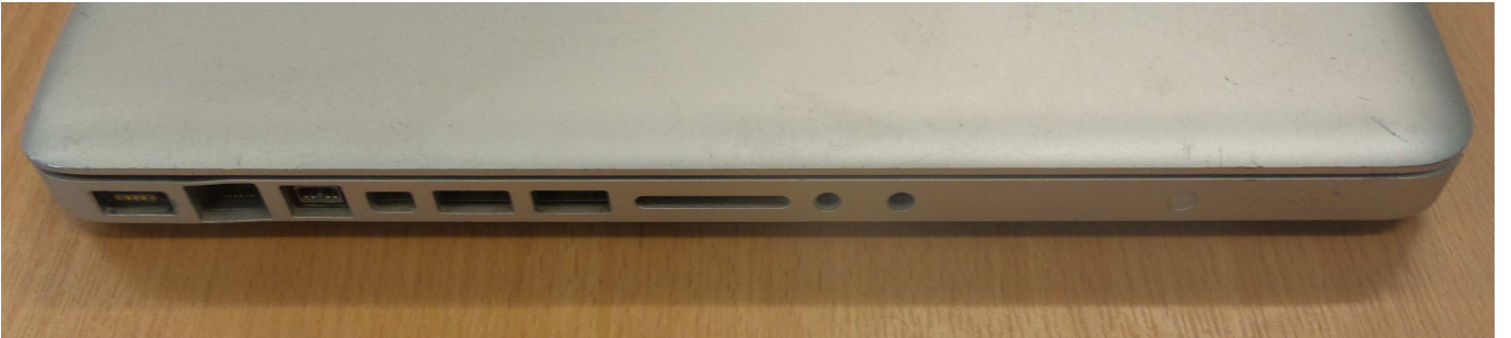
Figure 2: Apple MacBook Pro 5.1 left side view