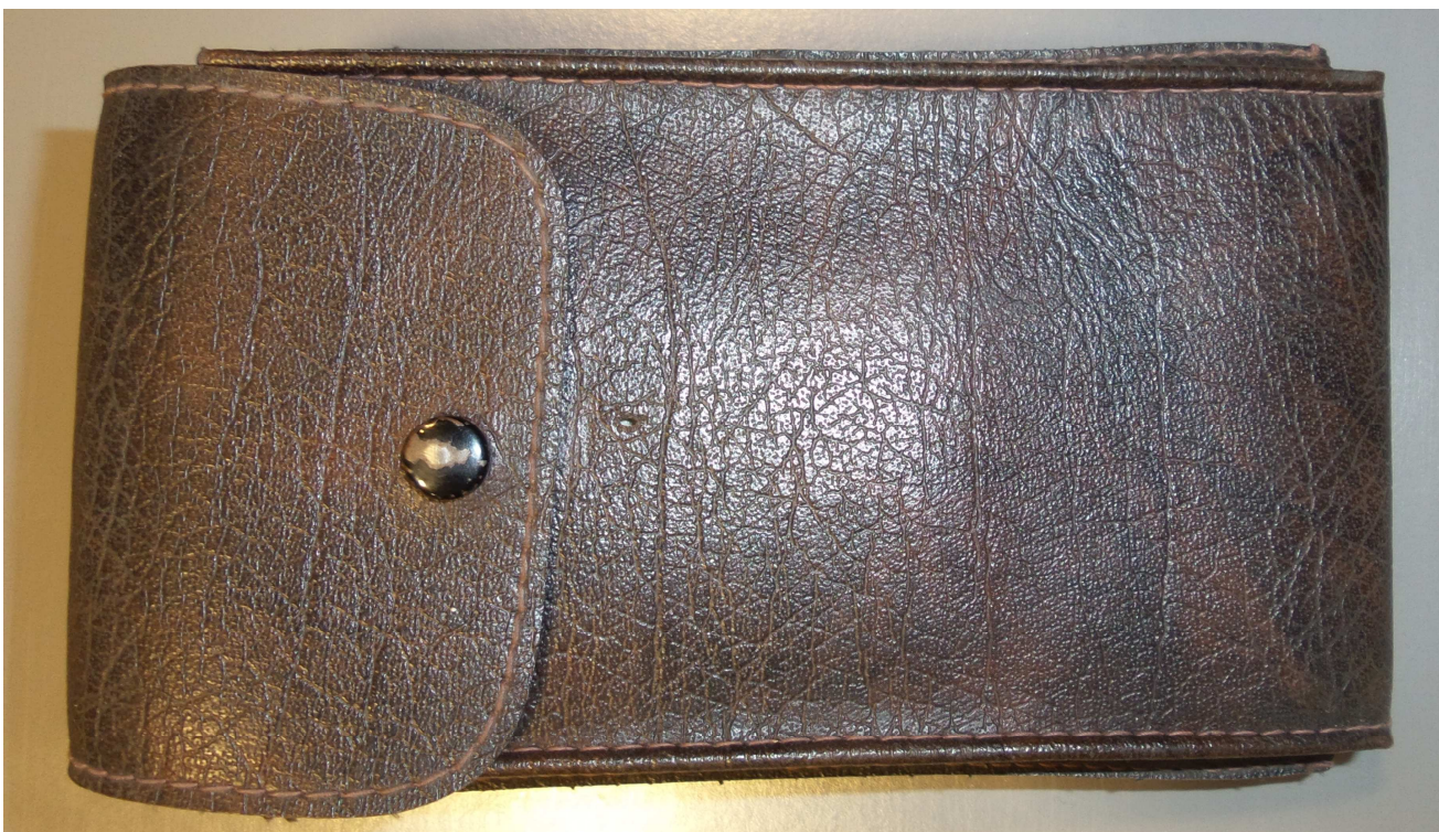
Figure 3: Anita 202/SR scientific calculator, carrying case