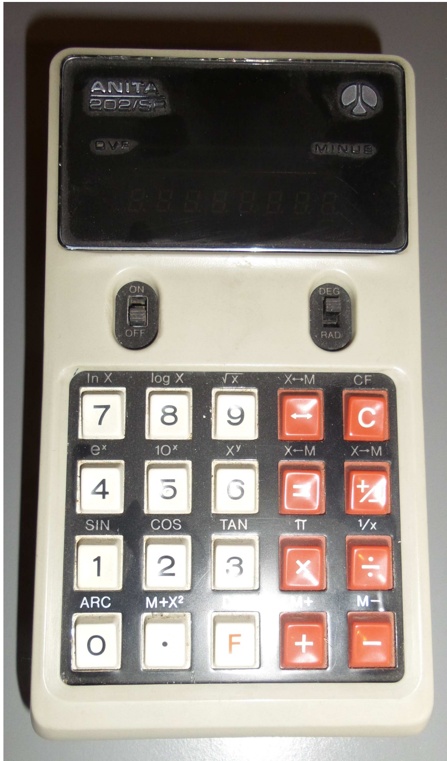
Figure 1: Anita 202/SR scientific calculator, front view