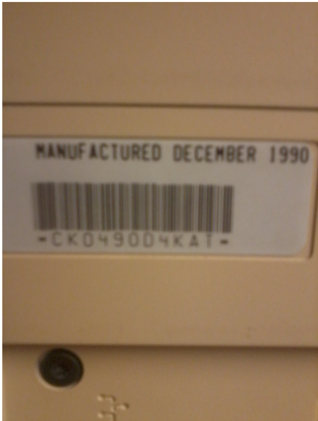
Figure 4: Apple Mac SE/30 (2) serial number