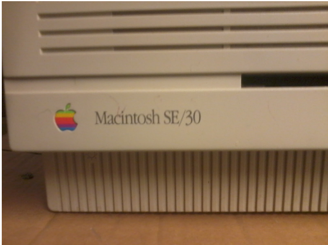
Figure 2: Apple Mac SE/30 (2) left front closeup