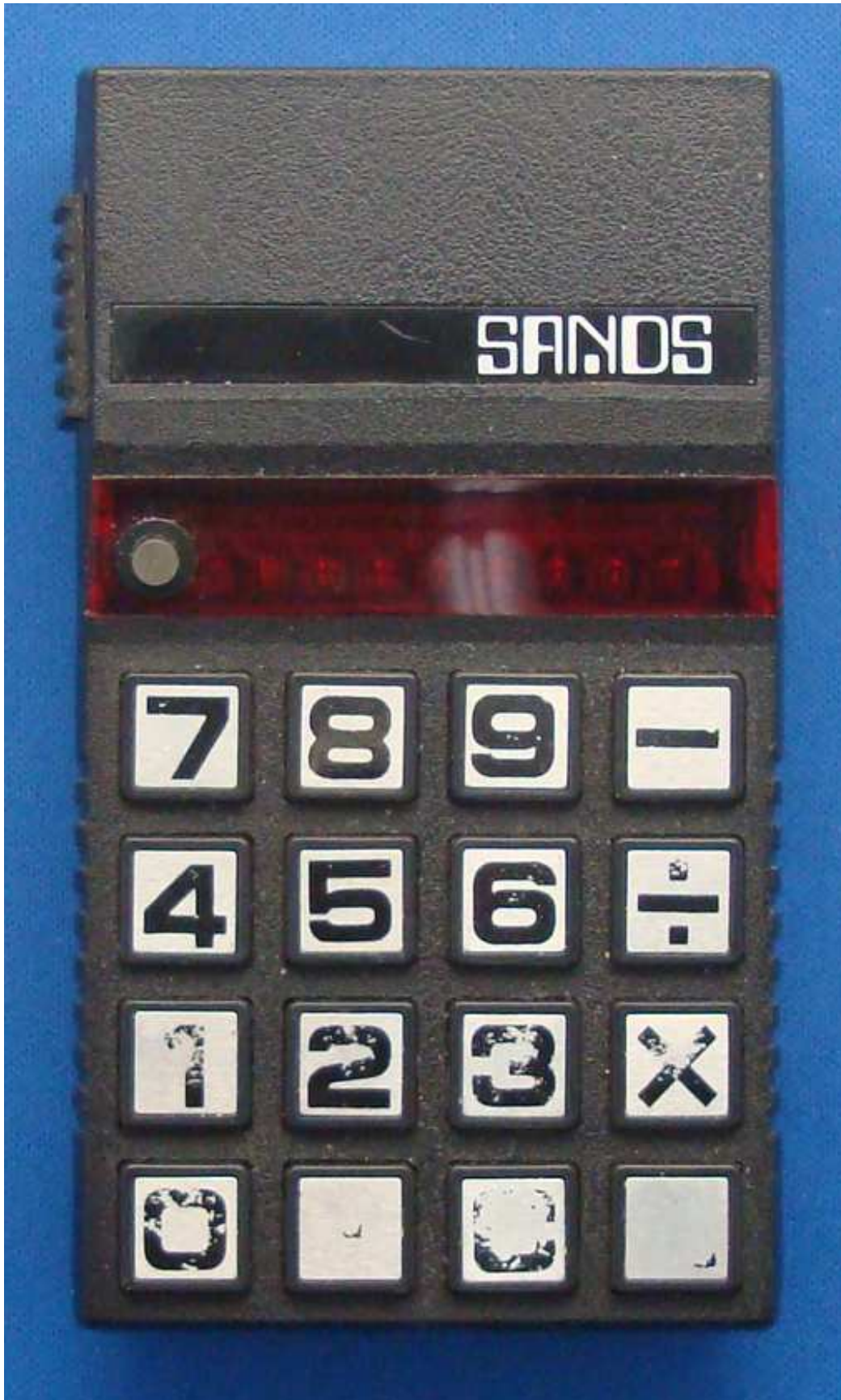
Figure 2: Sands Model 004 Calculator front view