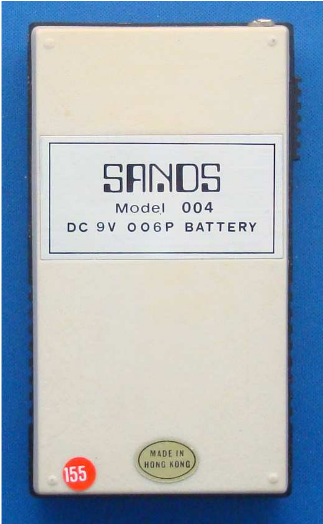
Figure 3: Sands Model 004 Calculator rear view