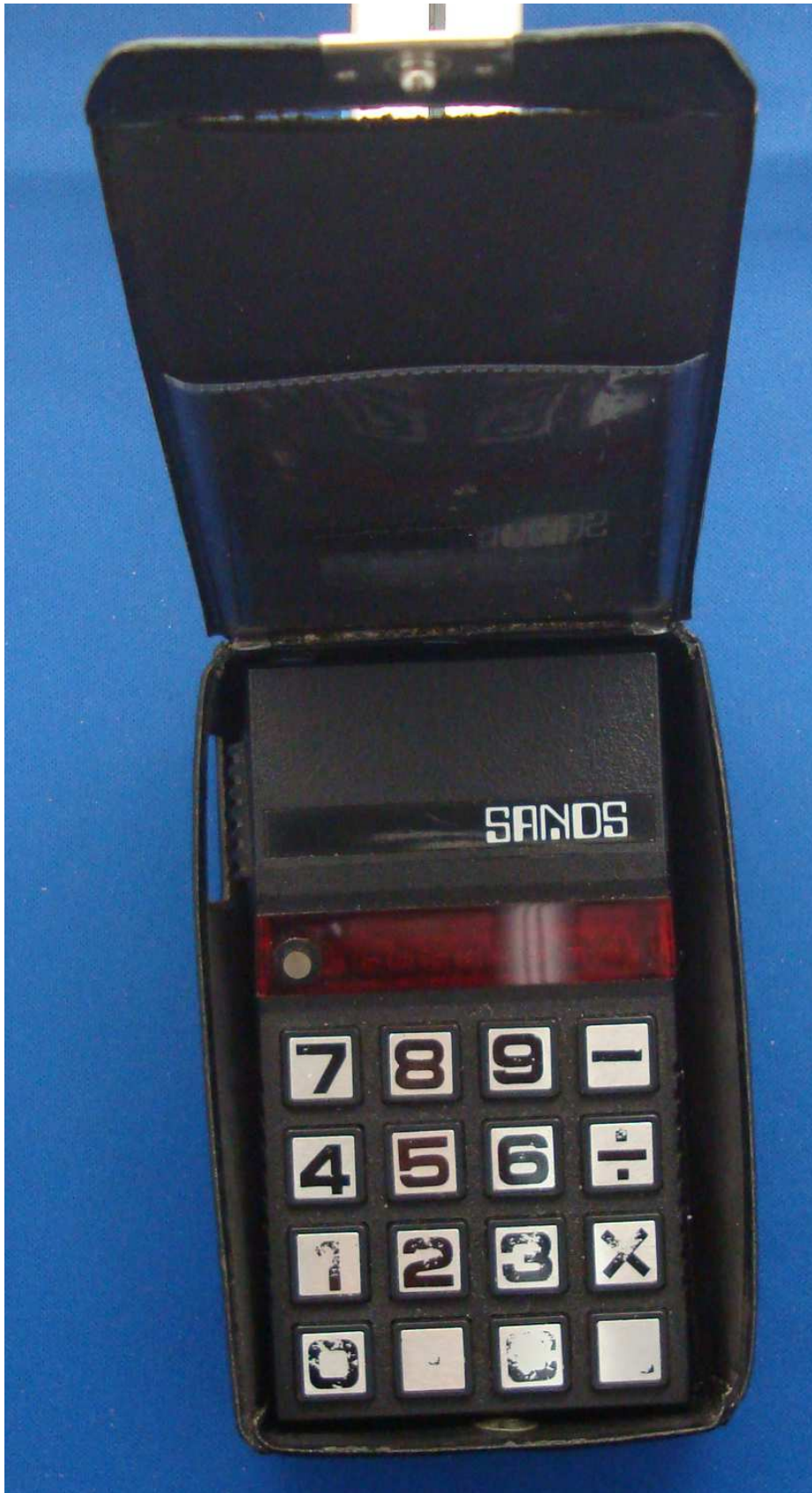
Figure 1: Sands Model 004 Calculator front view in case