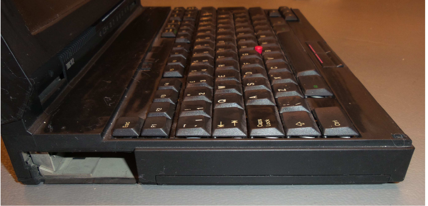
Figure 7: IBM Thinkpad 700C left side closeup