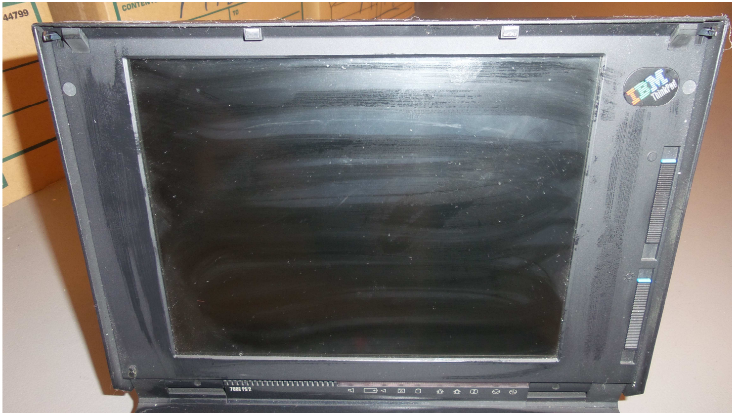
Figure 5: IBM Thinkpad 700C screen closeup Note "700C PS/2" at bottom left