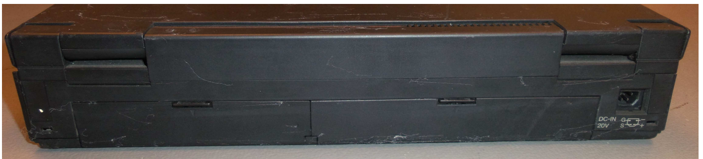
Figure 3 IBM Thinkpad 700C rear view