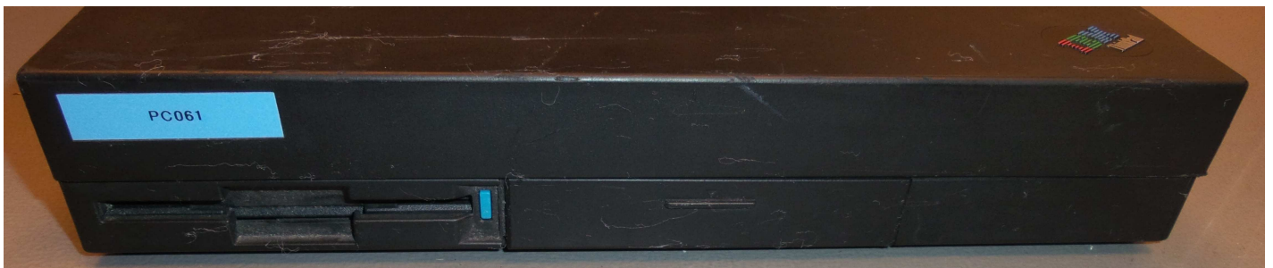
Figure 2: IBM Thinkpad 700C front view, case closed