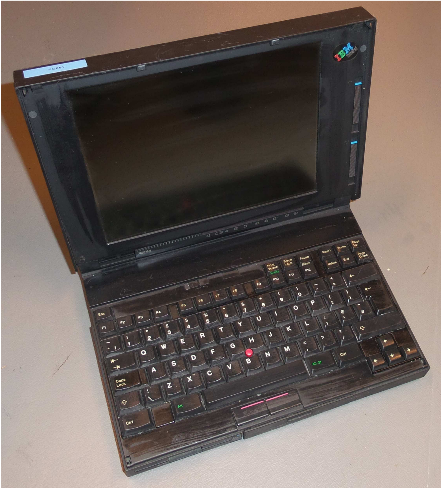
Figure 4: IBM Thinkpad 700C three-quarter front view, case open