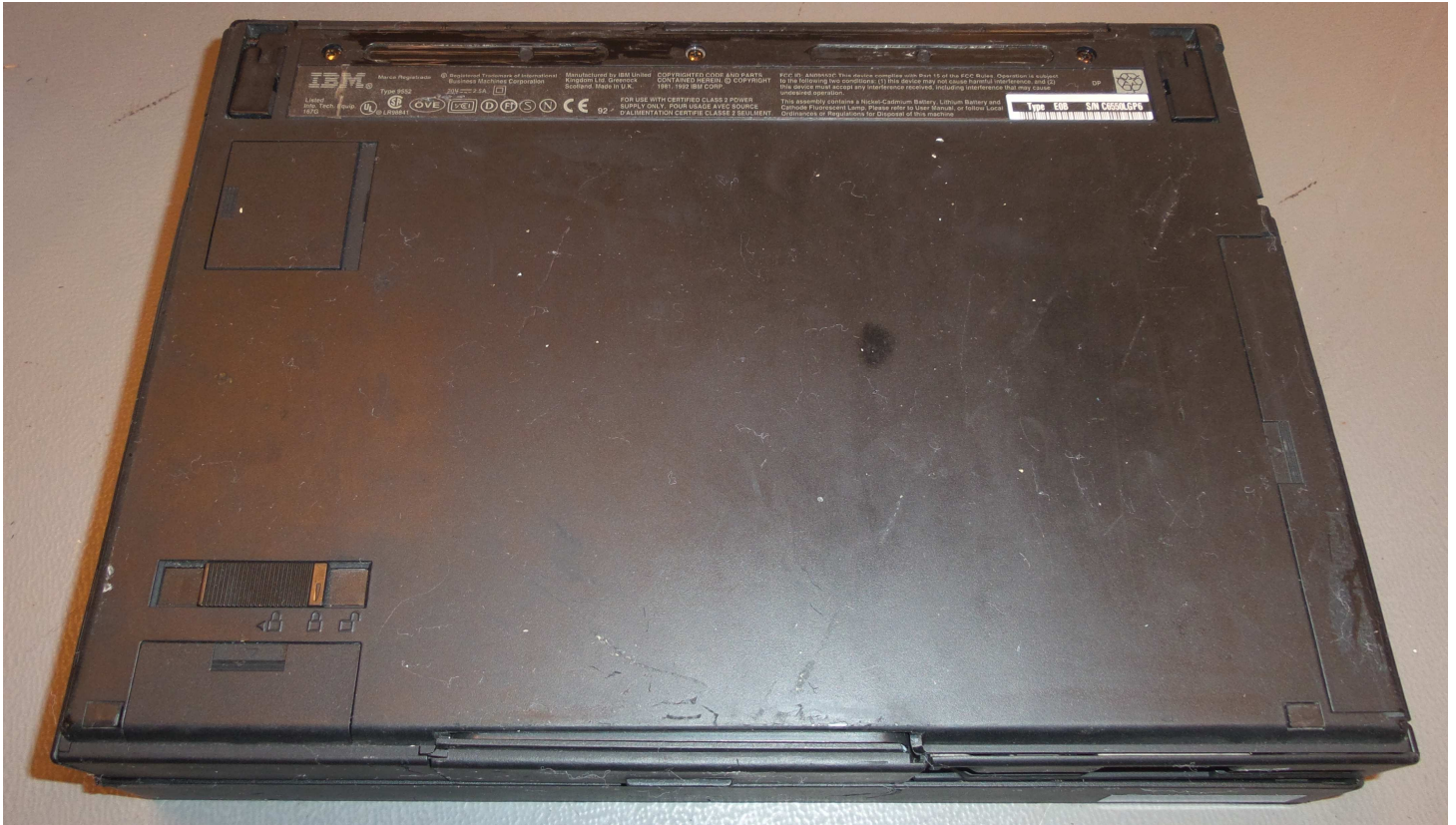
Figure 9: IBM Thinkpad 700C bottom view