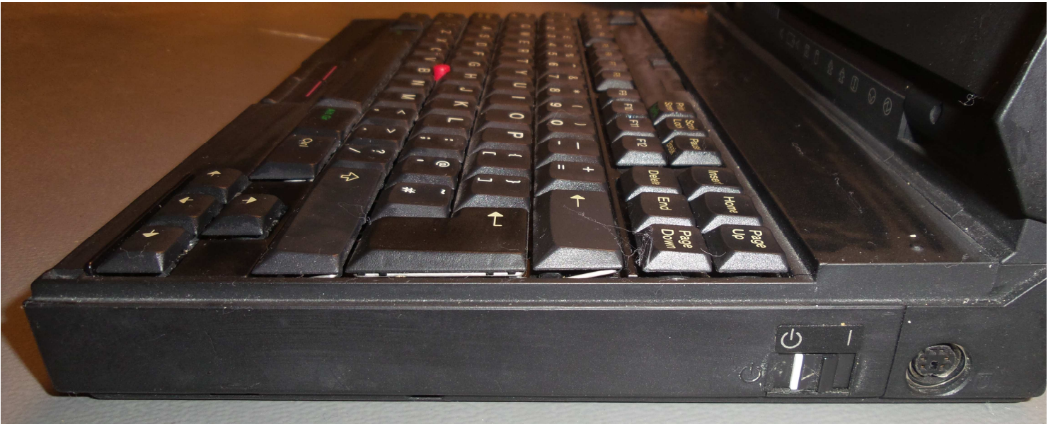
Figure 8: IBM Thinkpad 700C right side closeup