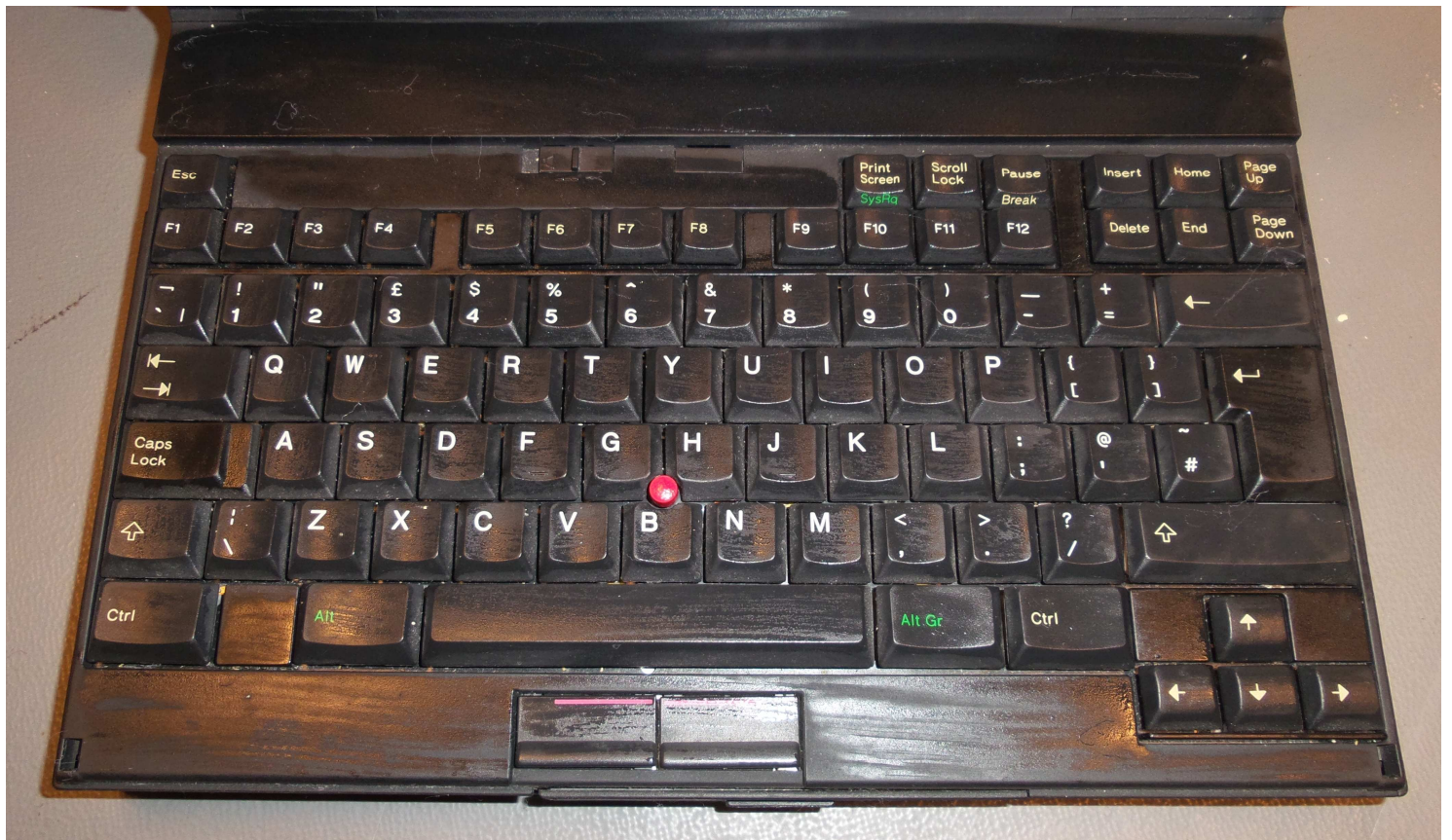
Figure 6: IBM Thinkpad 700C keyboard closeup