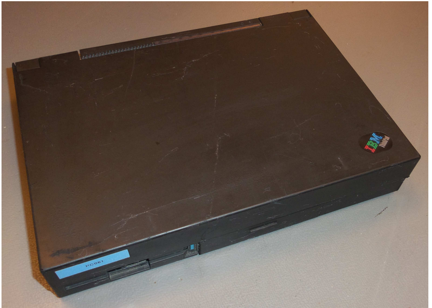
Figure 1: IBM Thinkpad 700C top three-quarter front view, case closed