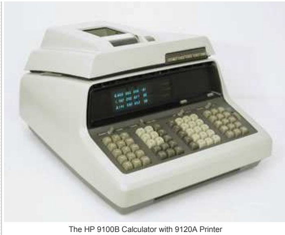
The HP 9100B Calculator with 9120A Printer

The HP 9100B , in 1970 doubles this capacity with maximums of 32 storage registers and 392 program steps. On both machines, core was shared between registers and program steps. (The 9100B had two pages of core.) The HP 9100B also added subroutines, a dual program display, and a key to recall numbered registers into X.