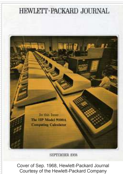
Cover of Sep. 1968, Hewlett-Packard Journal

The Model 9120A Printer , shown on the above photo, attaches to the top of the calculator. It is introduced in late 1969 for use with the 9100A and remains compatible with the 9100B version. The 9120A, electrostatic printer, prints the contents of display registers X, Y, Z, singly or in any combination, upon manual or programmed command.