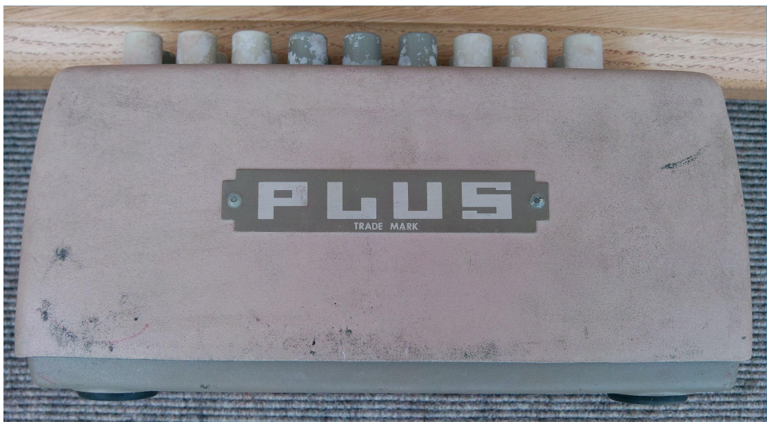
Figure 2: Plus 509 Adder front view