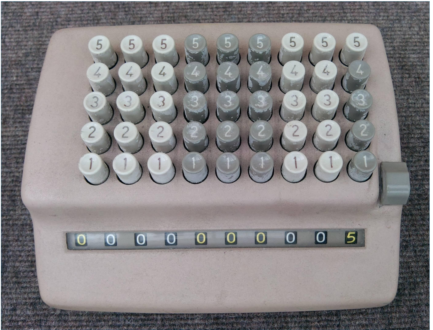
Figure 1: Plus 509 Adder top view