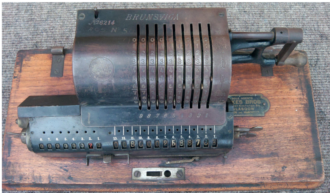
Figure 1: Brunsviga Adding Machine front top view