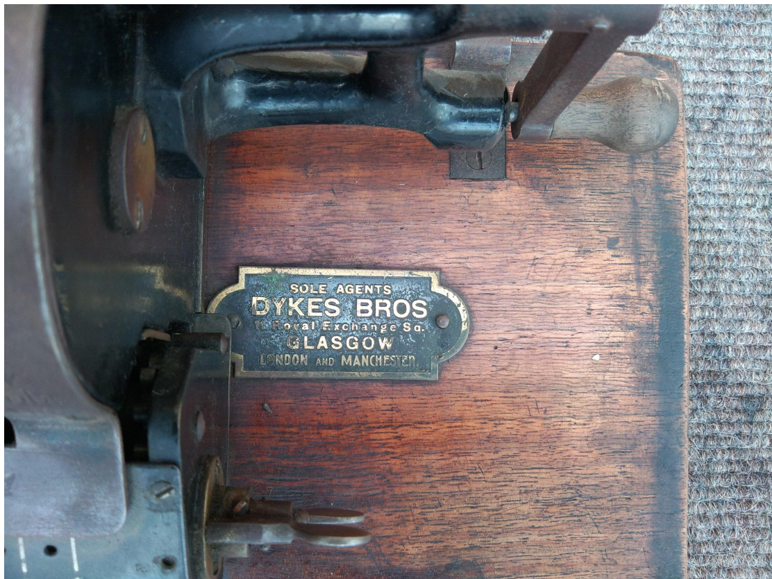
Figure 4: Brunsviga Adding Machine closeup of supplier label

Also note 'AGS No.50' for Arthur Guinness & Sons