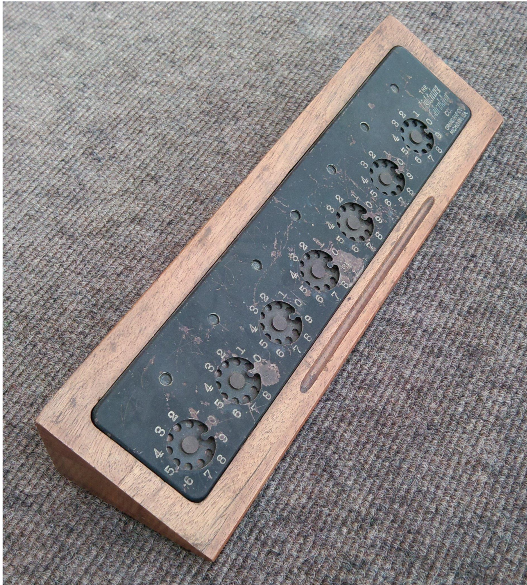
Figure 1: Lightning Calculator three-quarter view