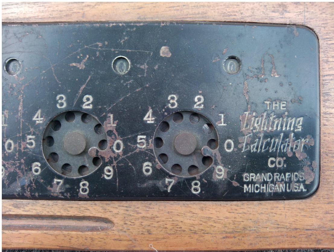
Figure 4: Lightning Calculator closeup of label