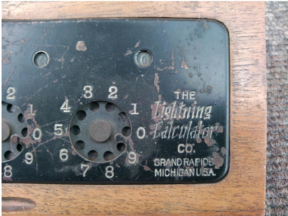
Figure 5: Lightning Calculator further closeup of label